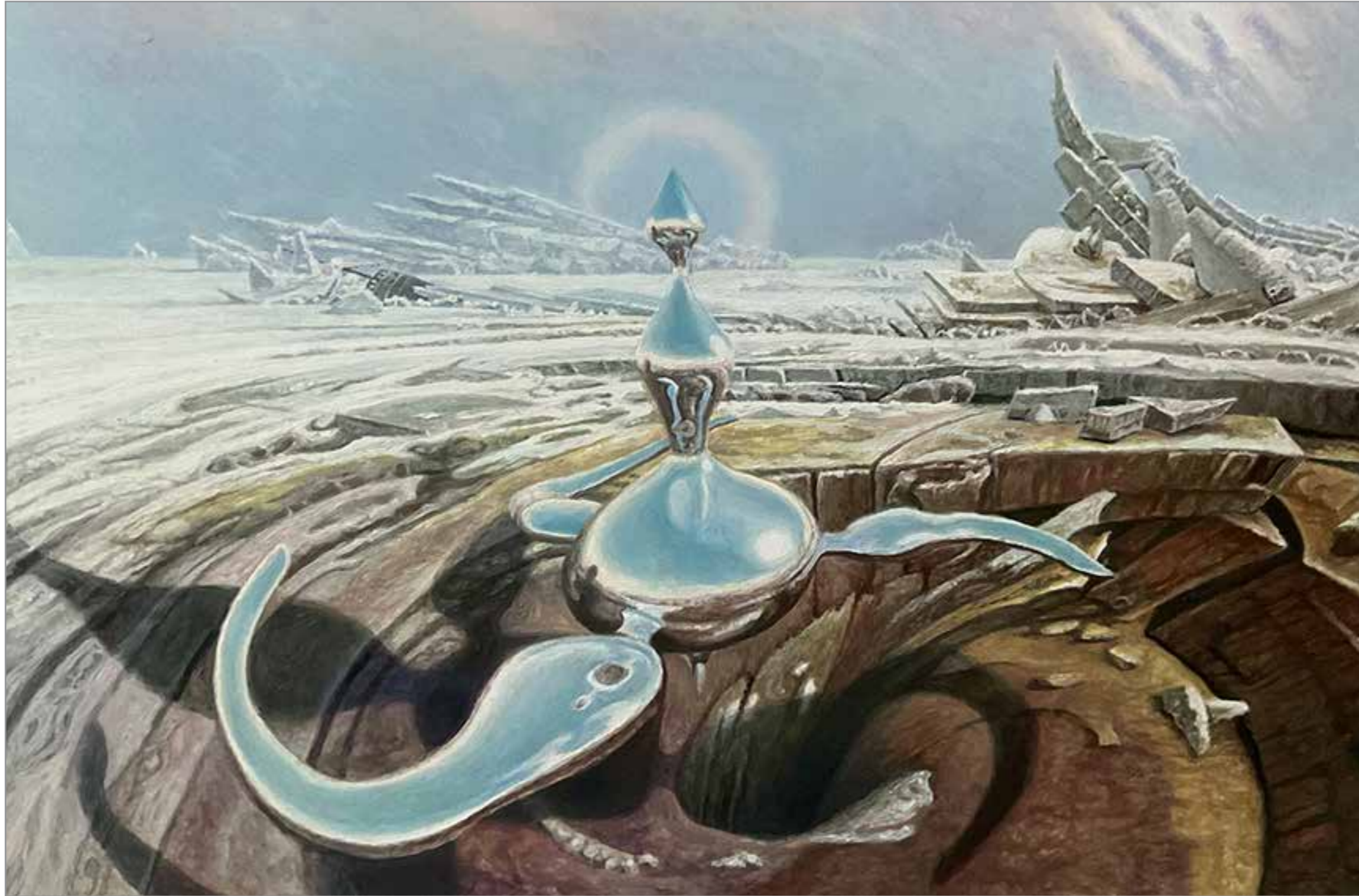
Talsia lost hope in the ocean of ice - oil on canvas - 150 x 93 cm.