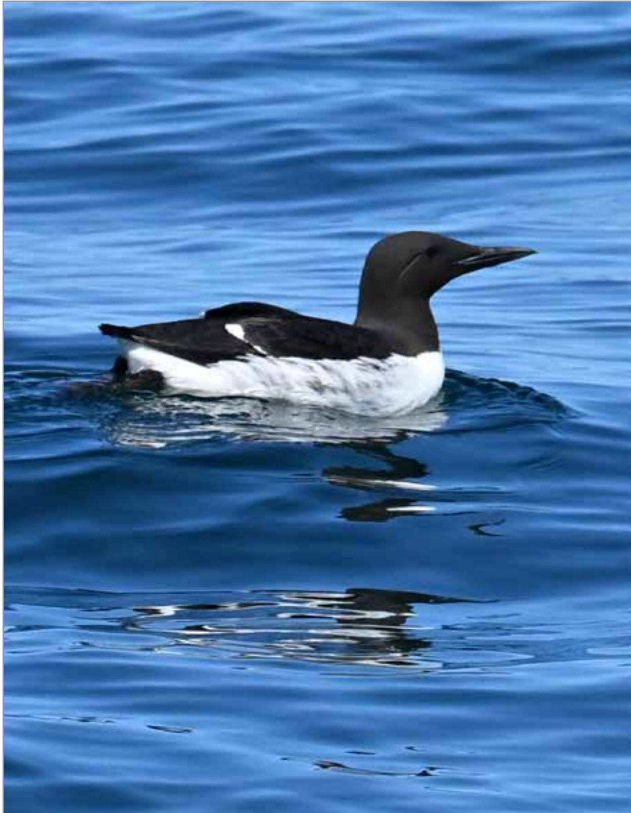
Common murre onward looking