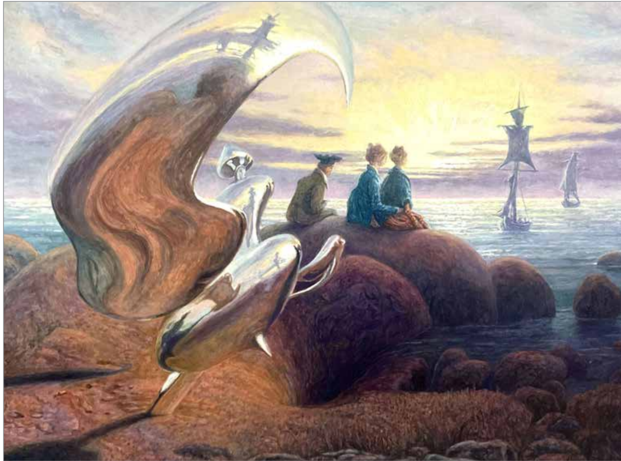
Talsia witnesses a difficult decision - oil on canvas - 150 x 93 cm