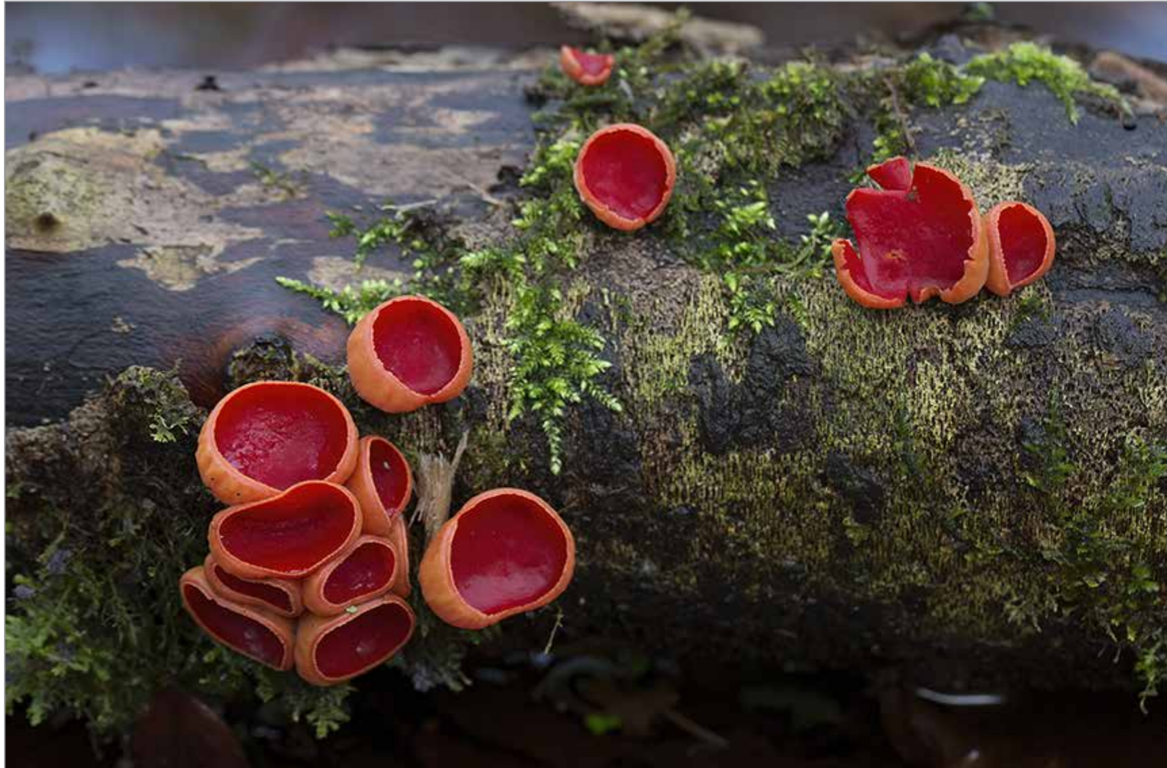
Scarlet Elfcup Fungi