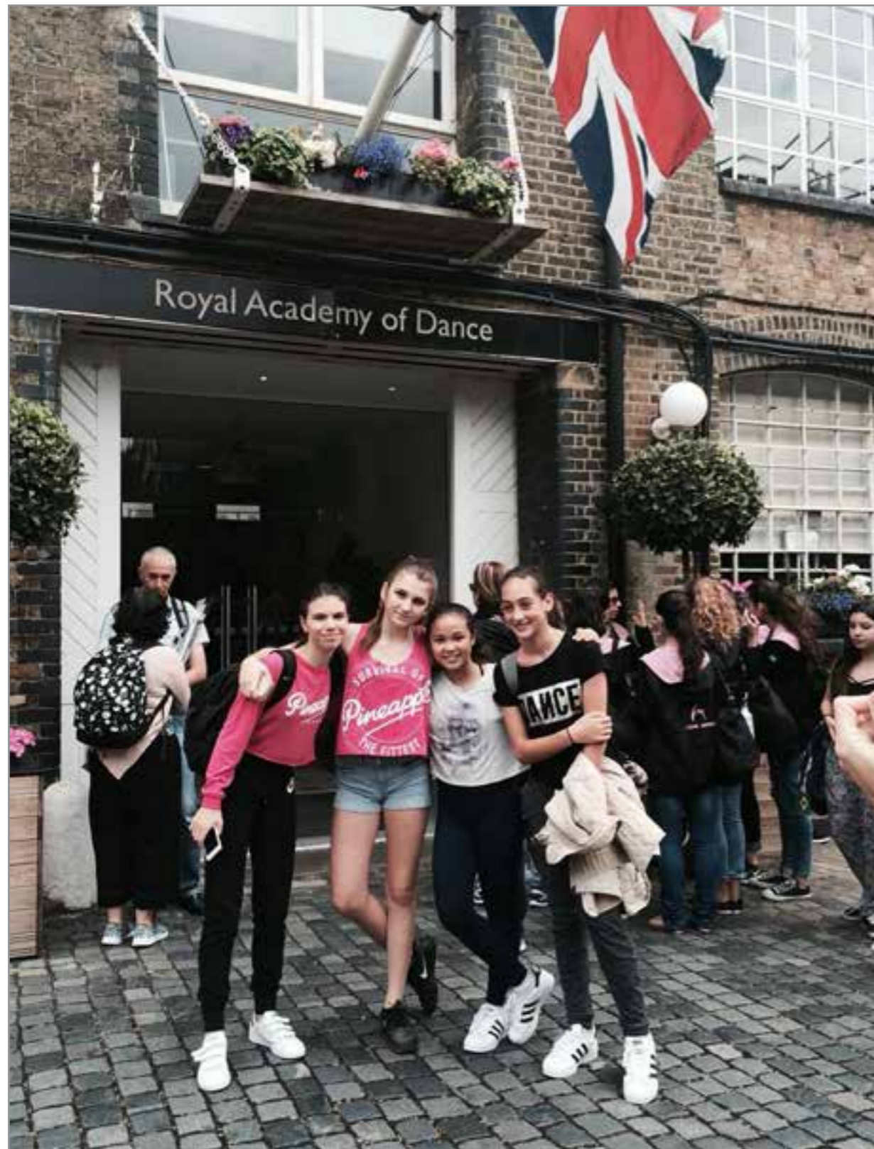
At The Royal Academy of Dance

“Indonesia is one of the leading biodiverse countries in the world. It is said to host 17% of the world’s wildlife. Not to mention that we have 270 languages.