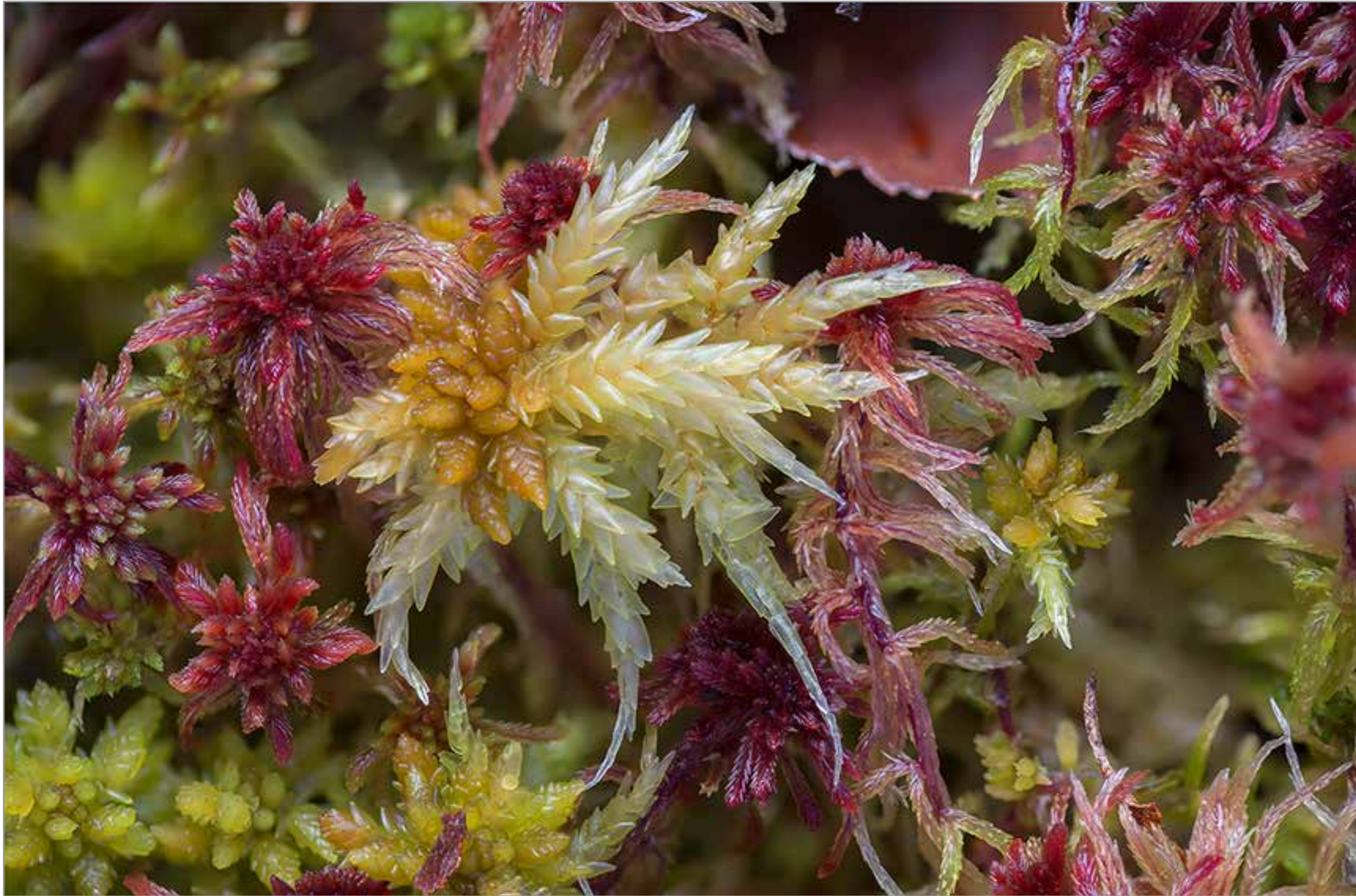
Bouquet of Sphagnum