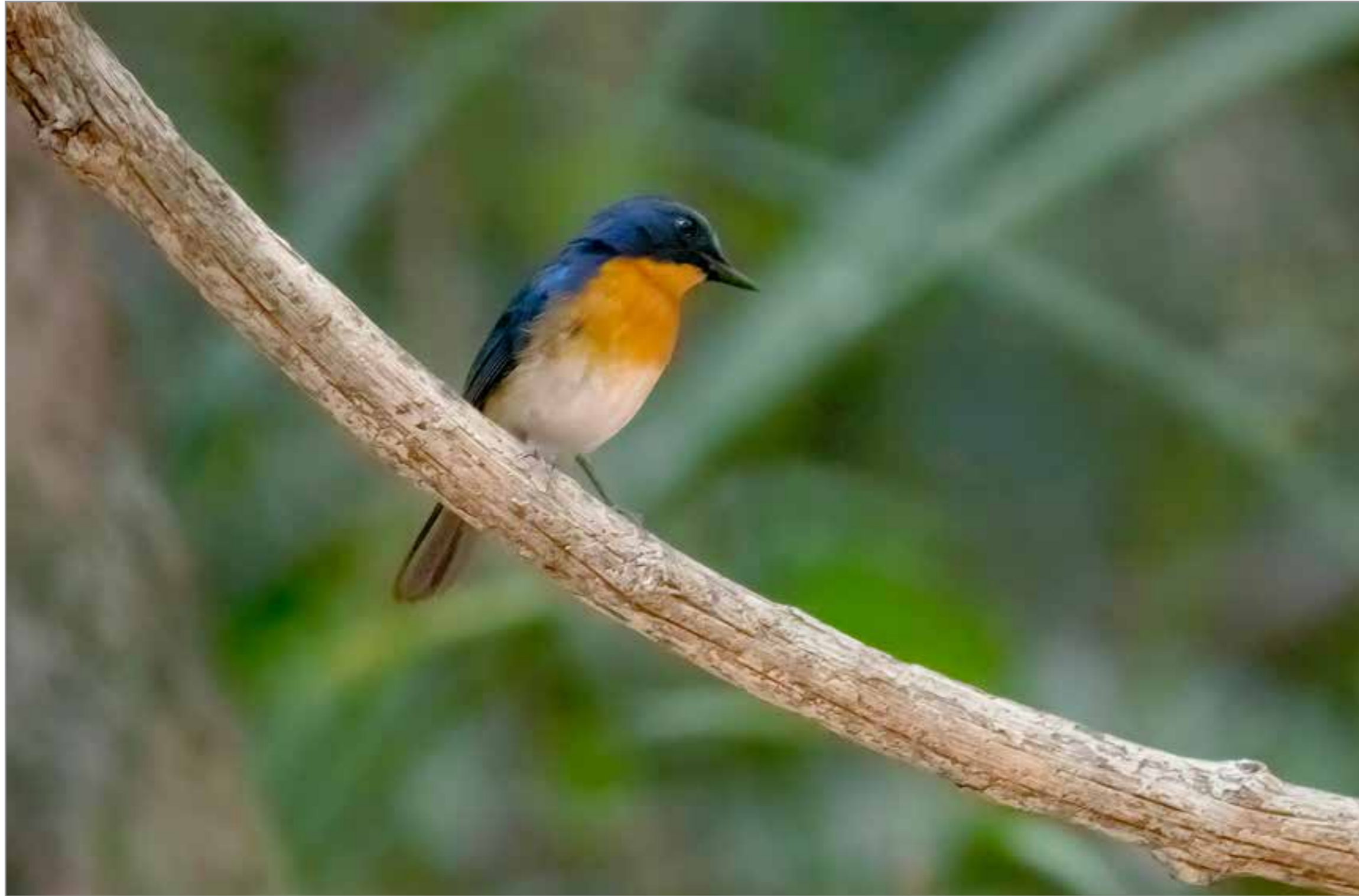
Indo-Chinese Blue Flycatcher