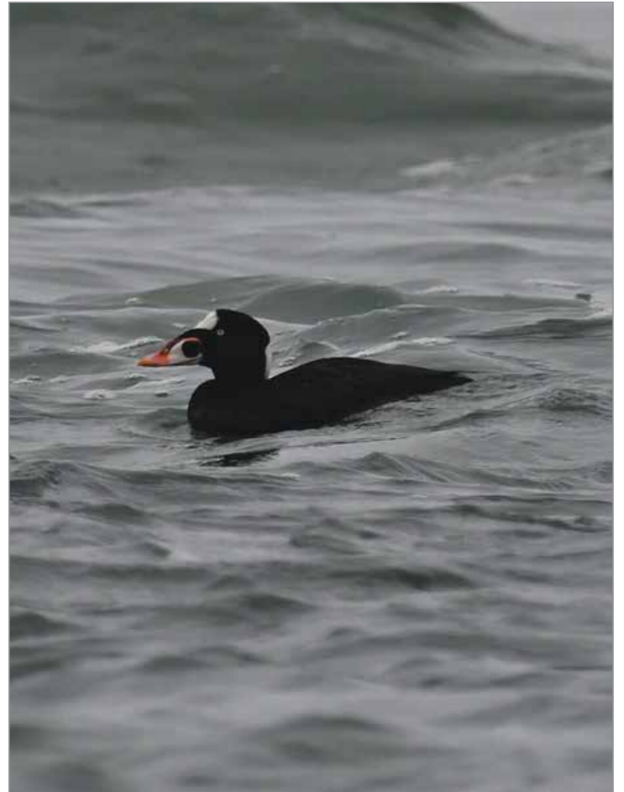
Surf Scoter riding the waves