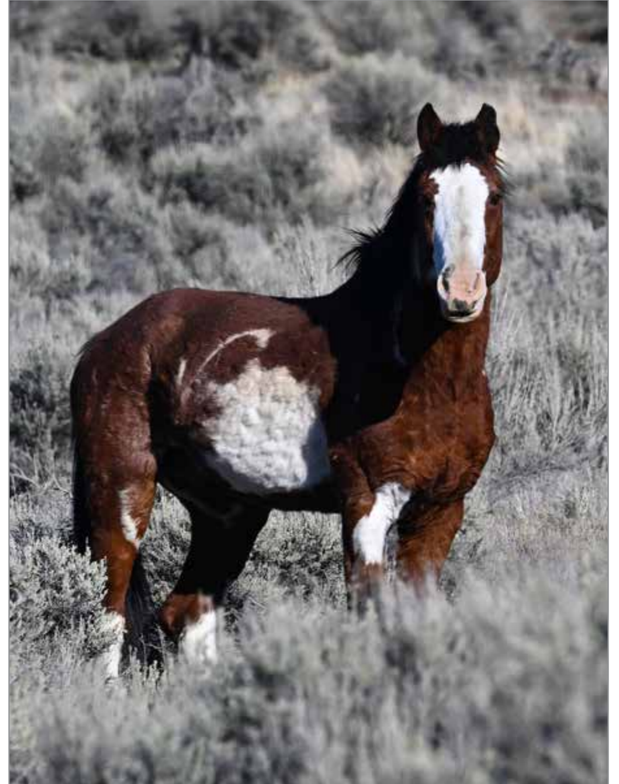
A Steen Mountain mustang living wild and free.