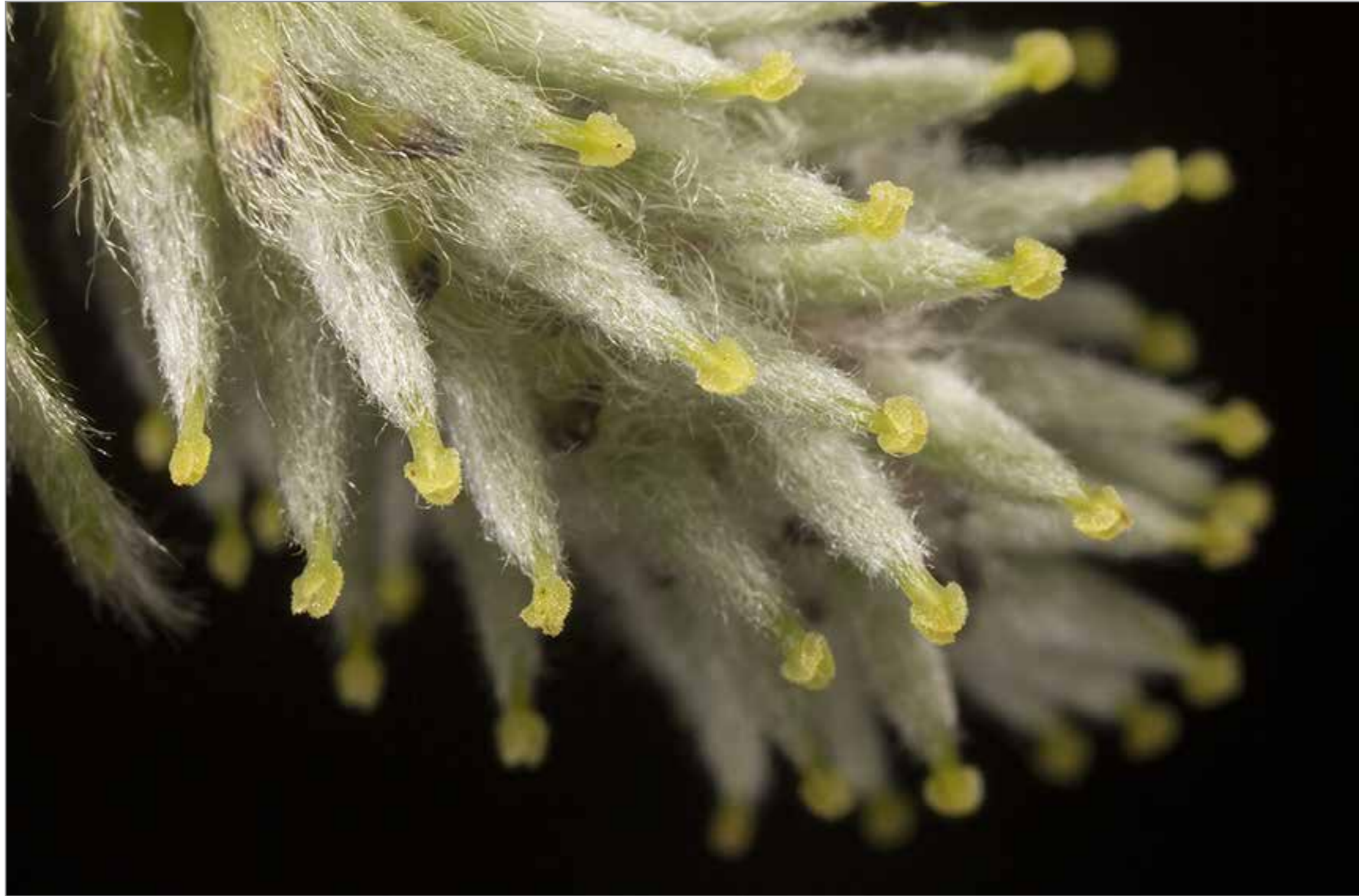
Willow Female Catkins