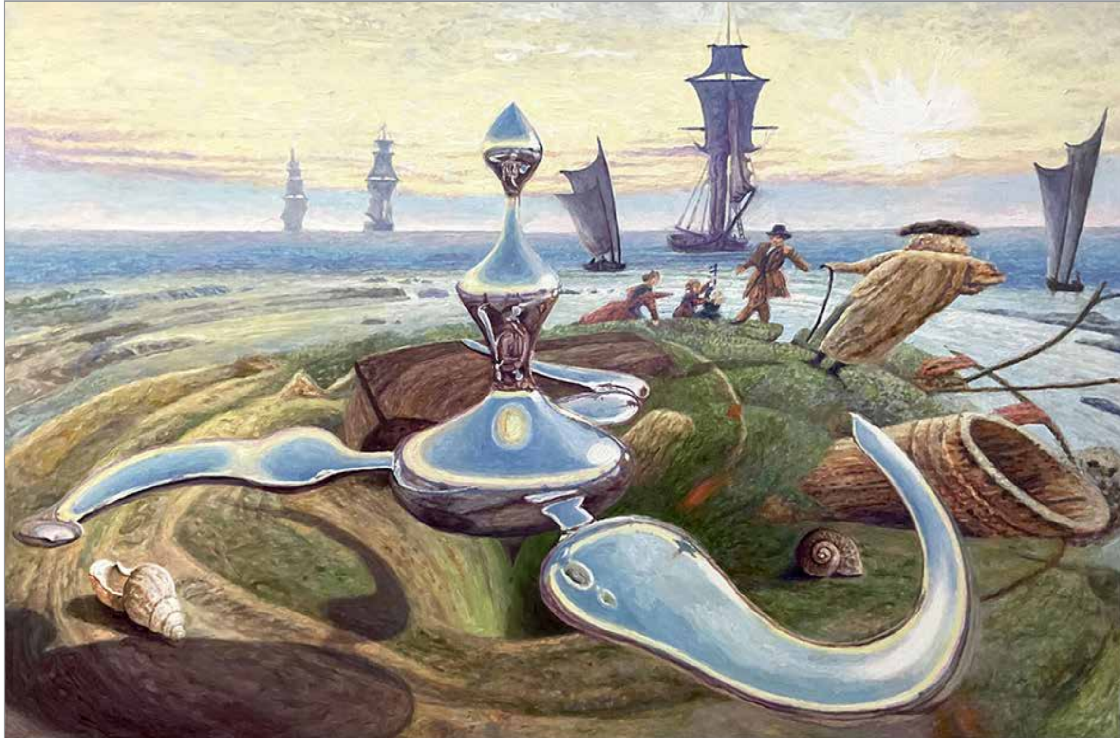
Venusian Queen contemplating the three ages - oil on canvas - 150 x 93 cm