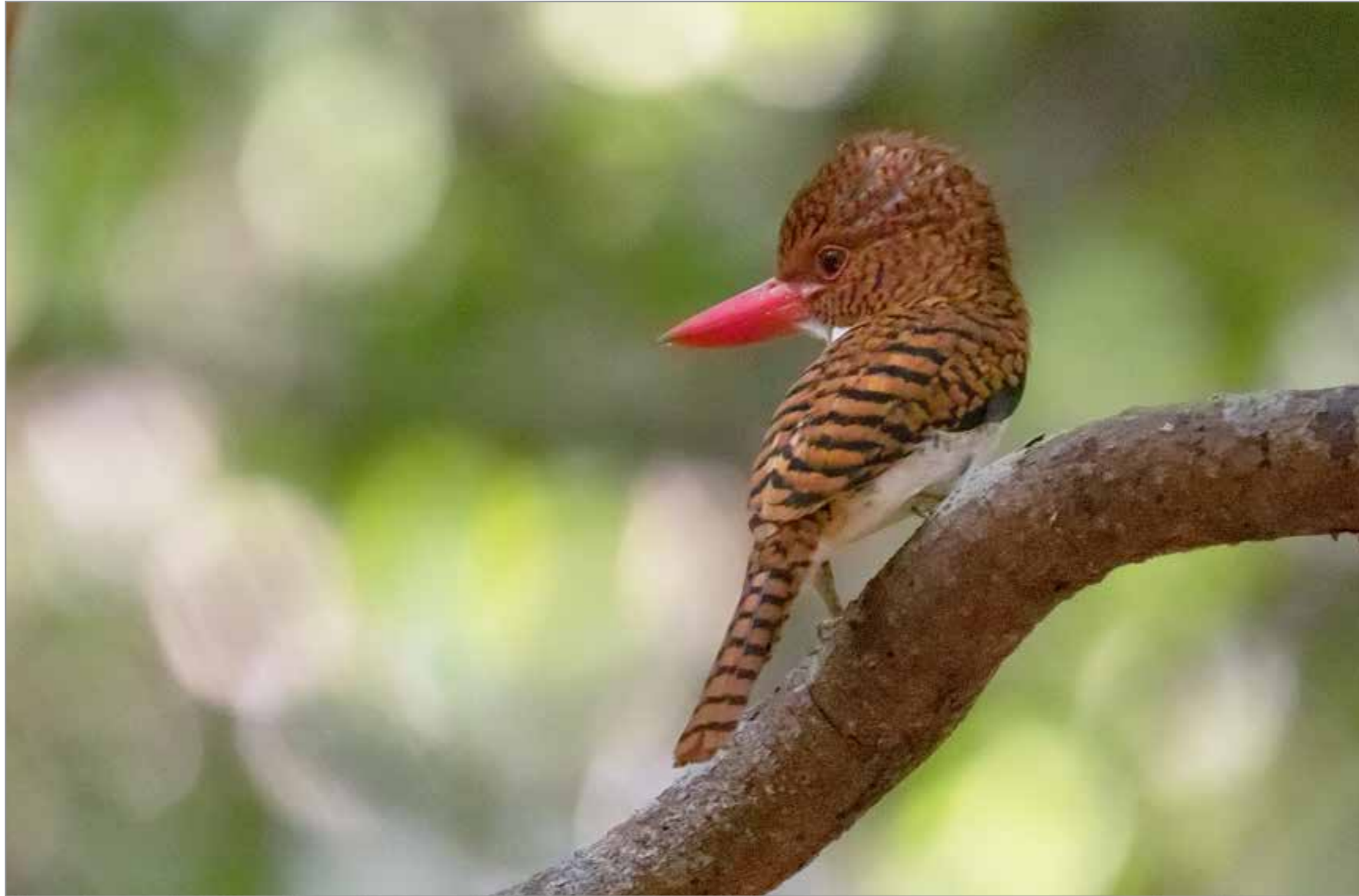
Banded Kingfisher (female)