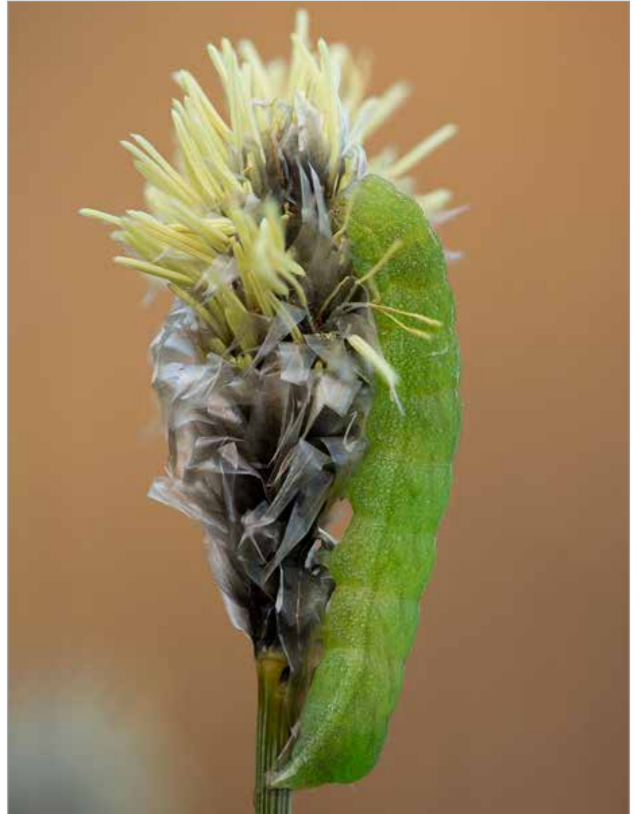
Angle Shades Caterpillar on Hares Tail Cottongrass