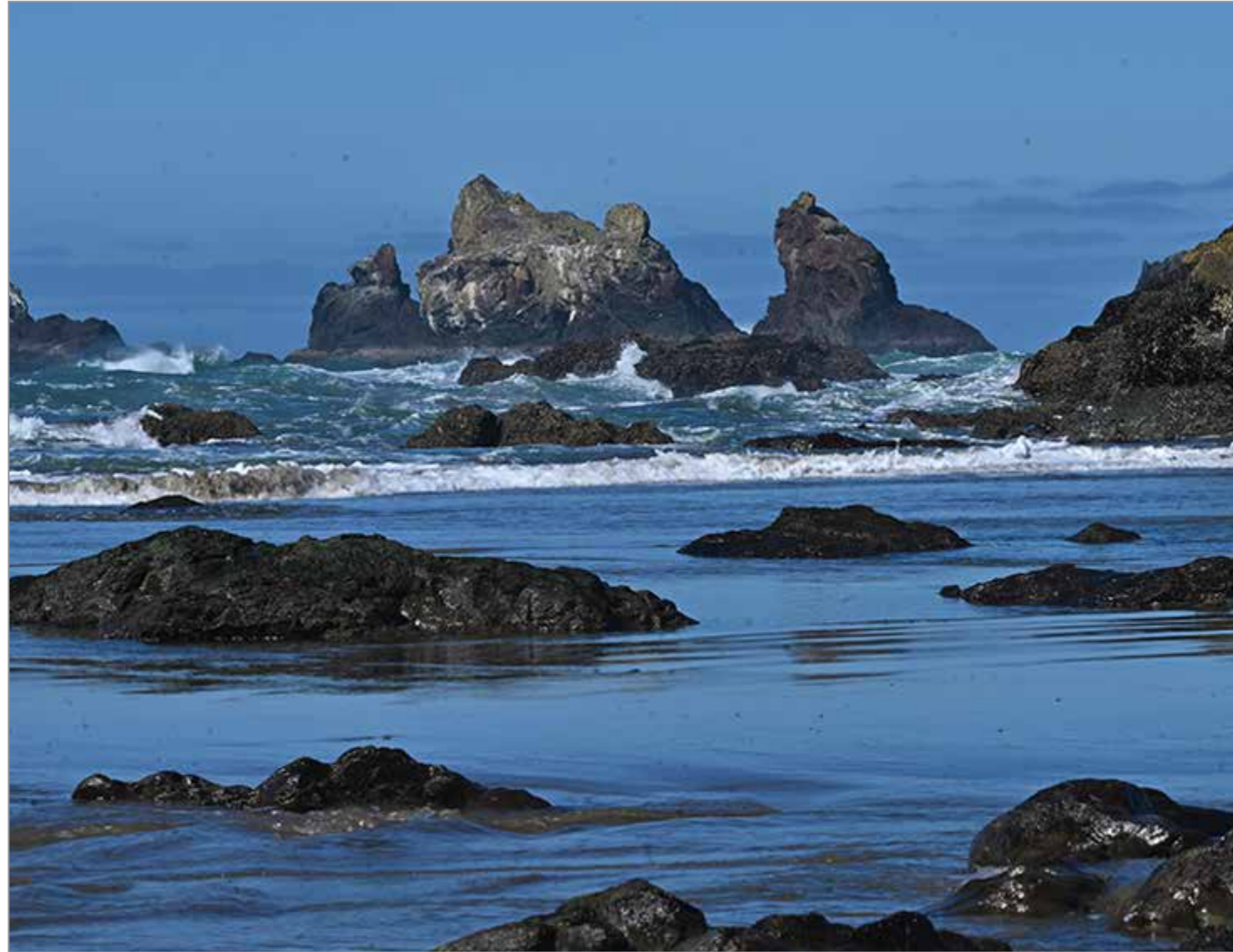
Bandon Beach's many yesterday