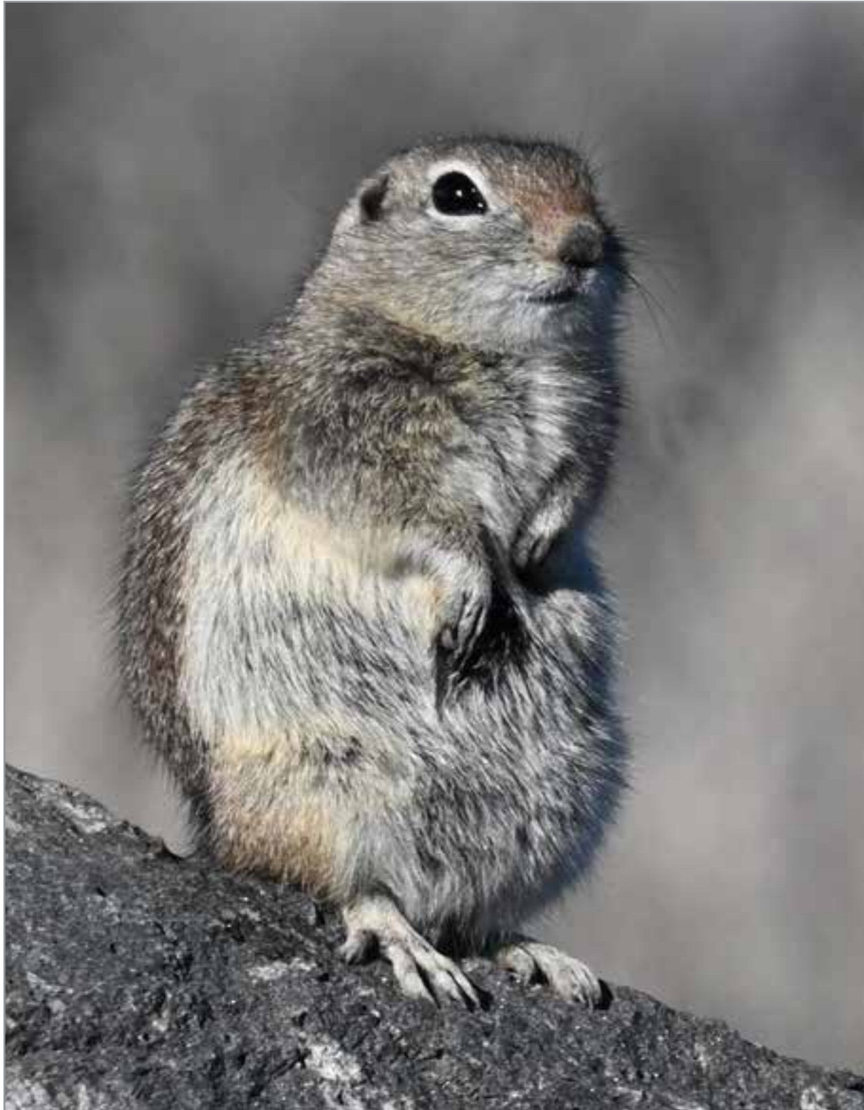
Rock squirrel poses for the cameras