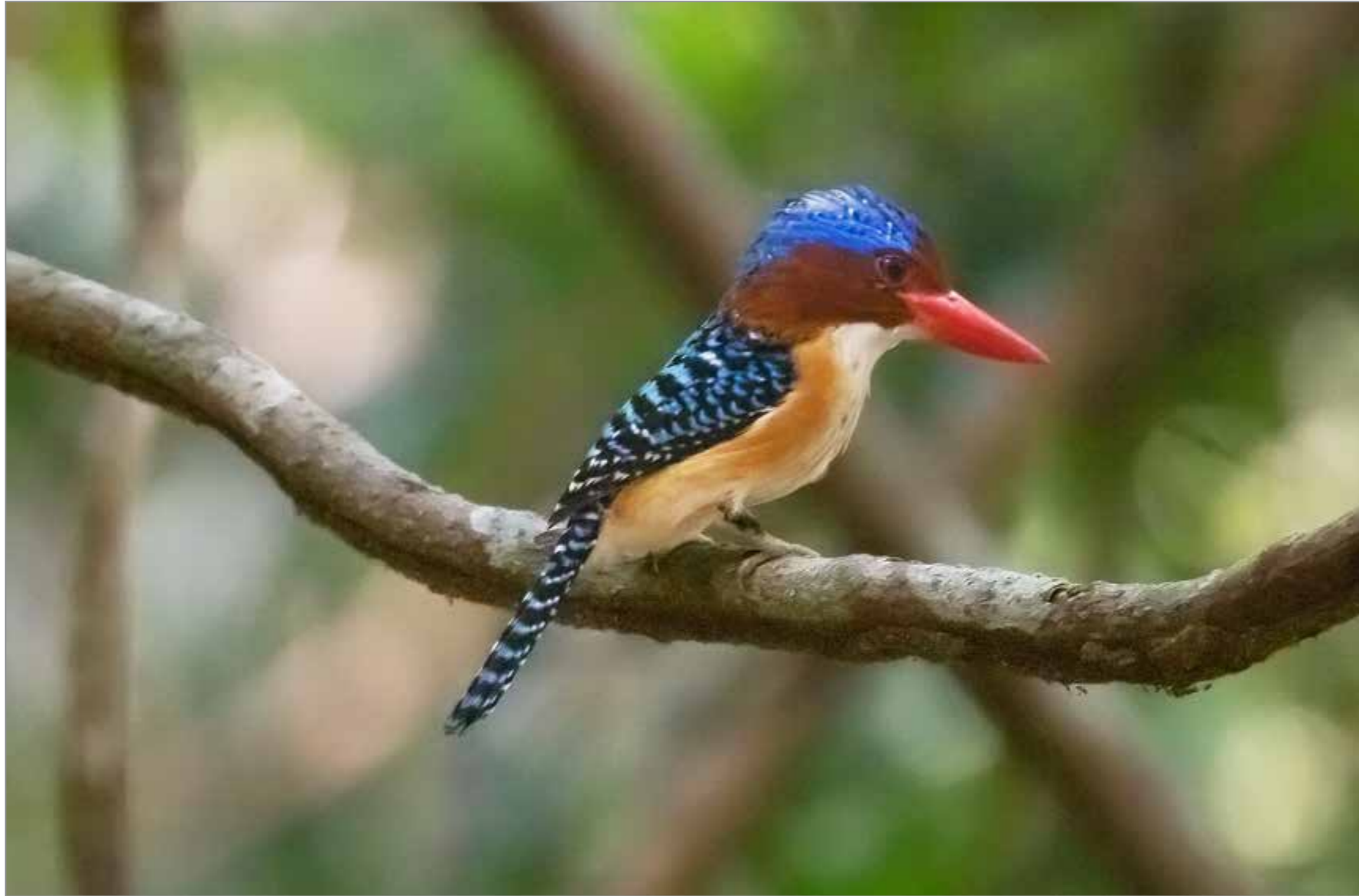
Banded Kingfisher (male)