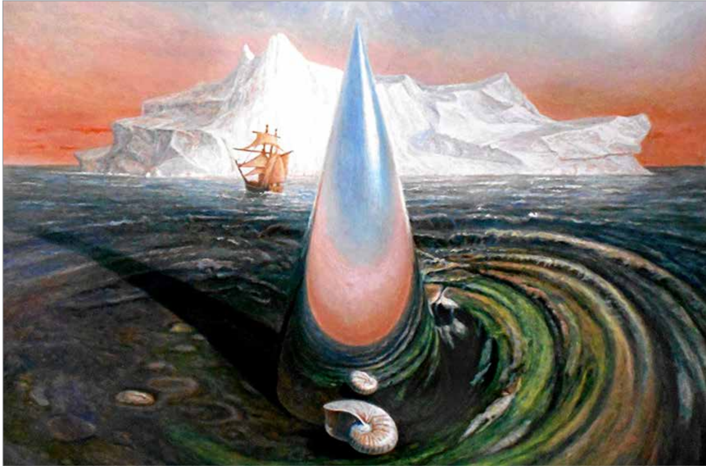
The King in Antarctica - oil on canvas - 160 x 100 cm