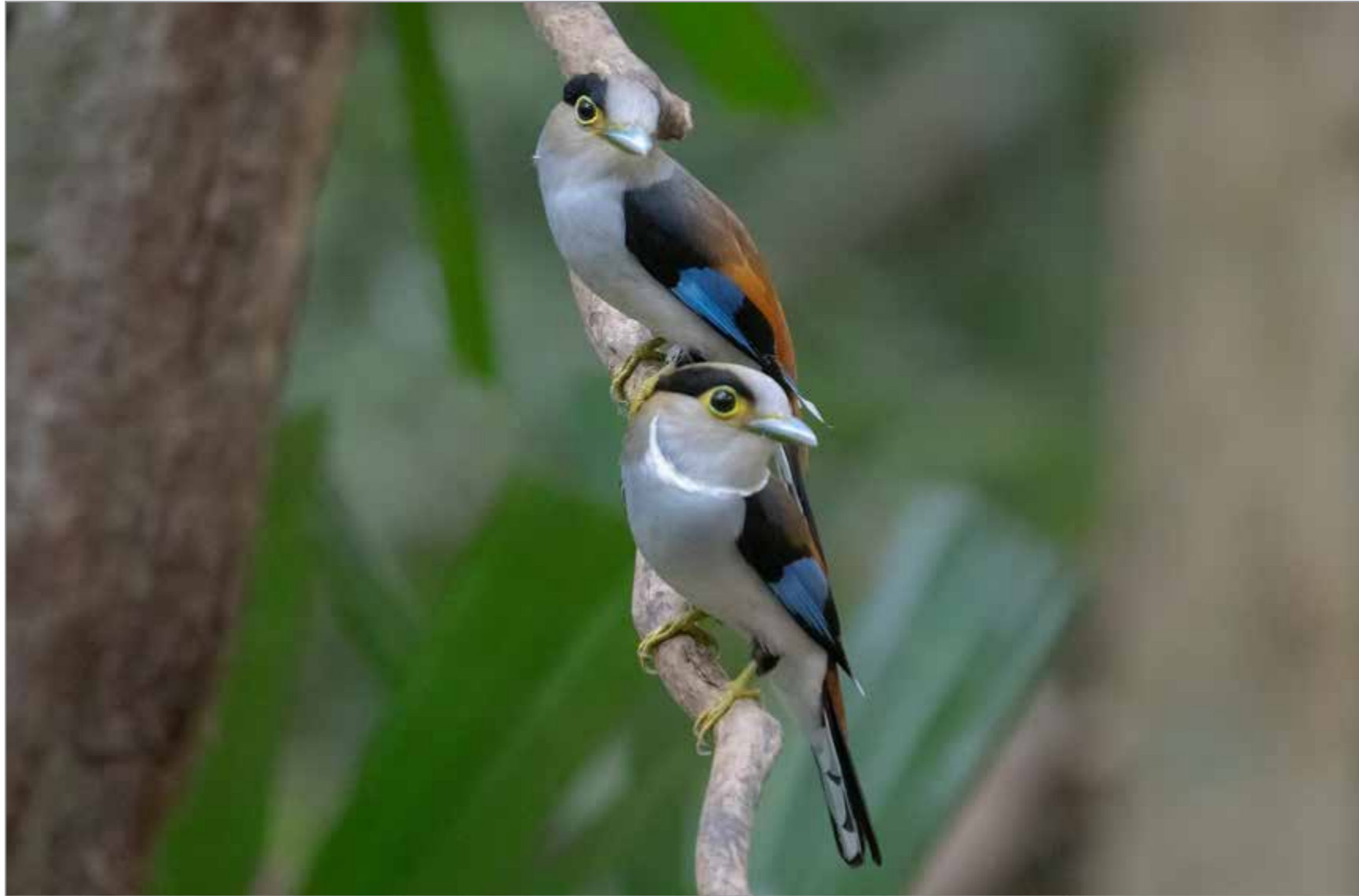
Silver breasted Broadbill