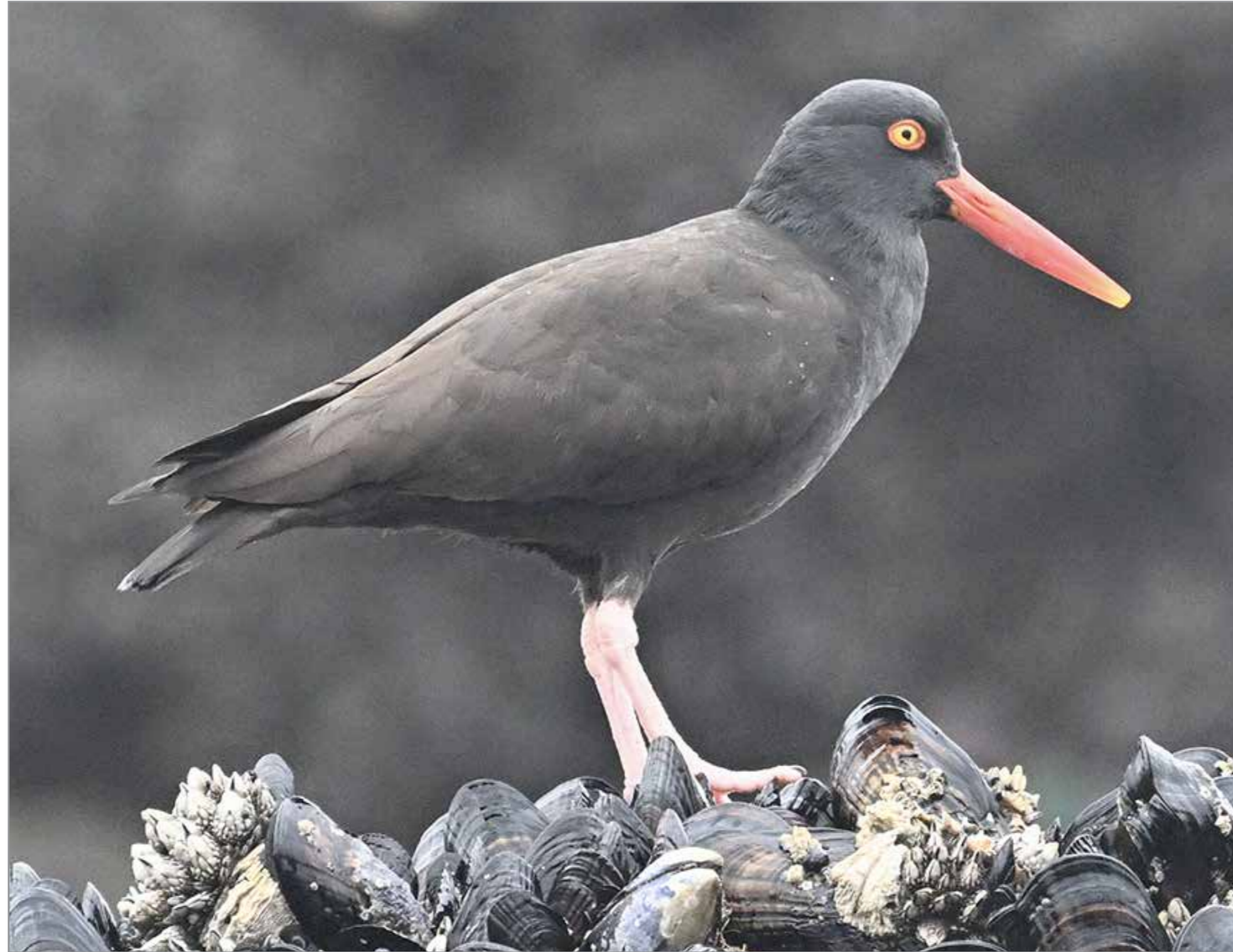
An oystercatchers delight