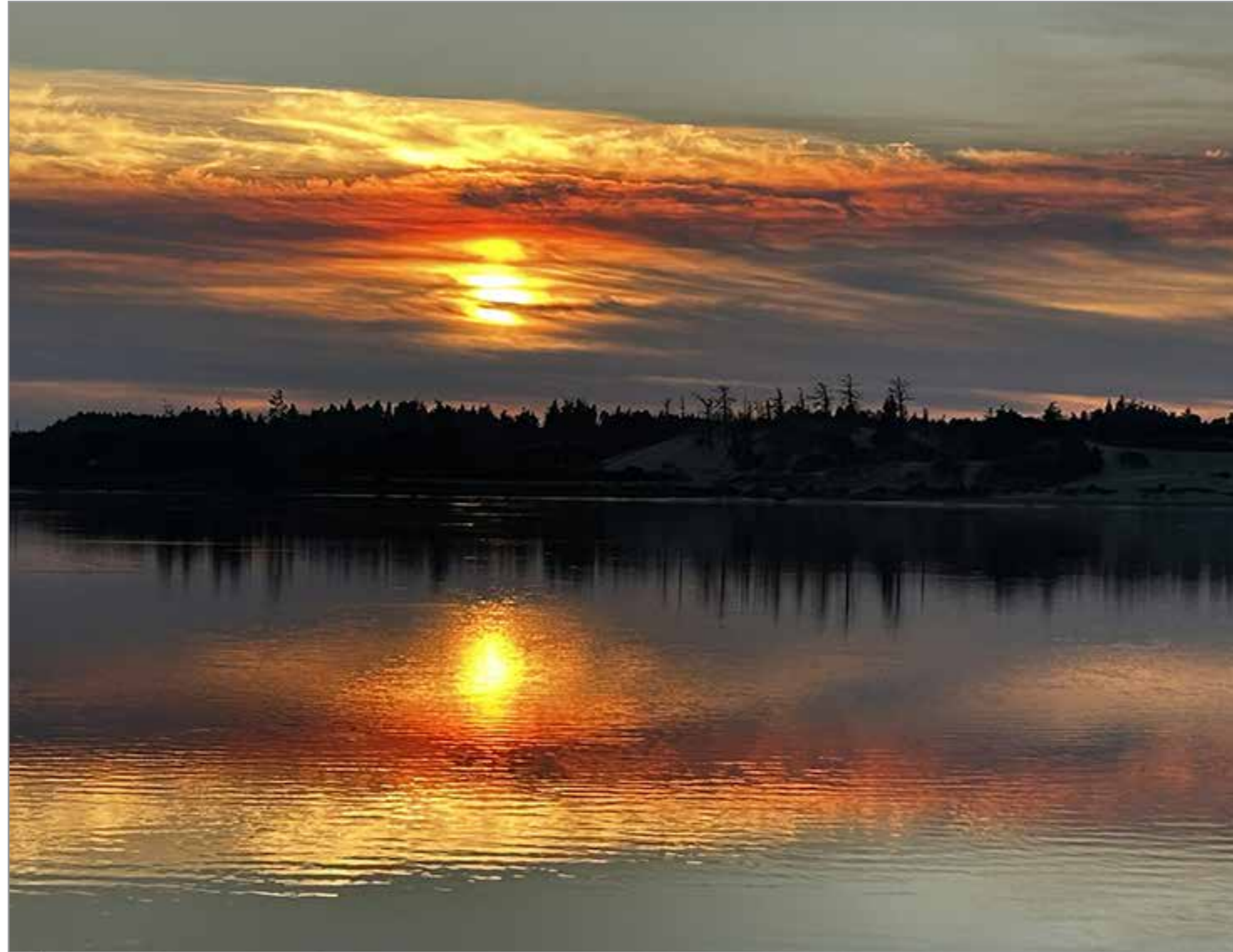
An Oregon Sunset