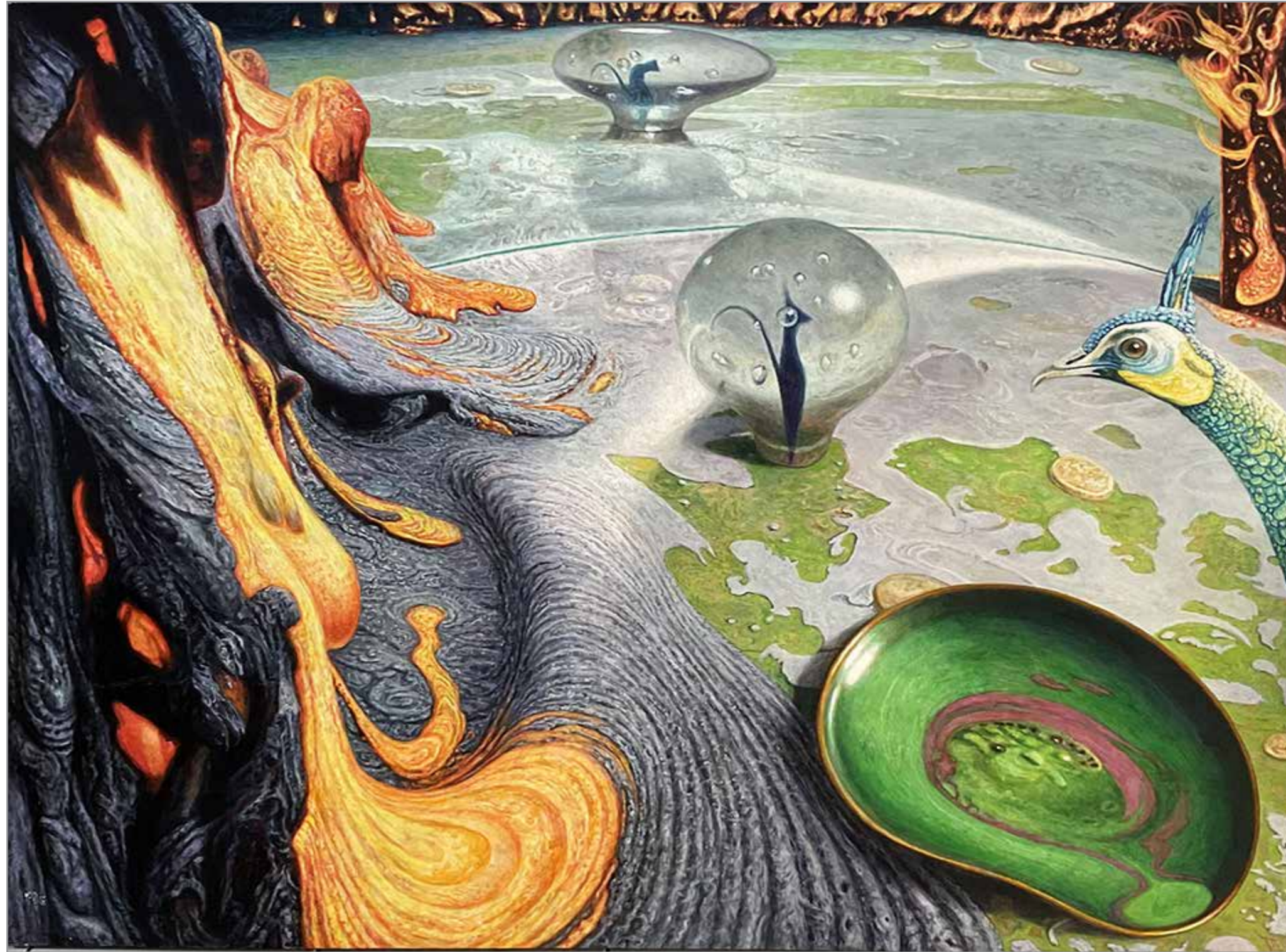
The blue scout - oil on canvas - 180 x 150 cm