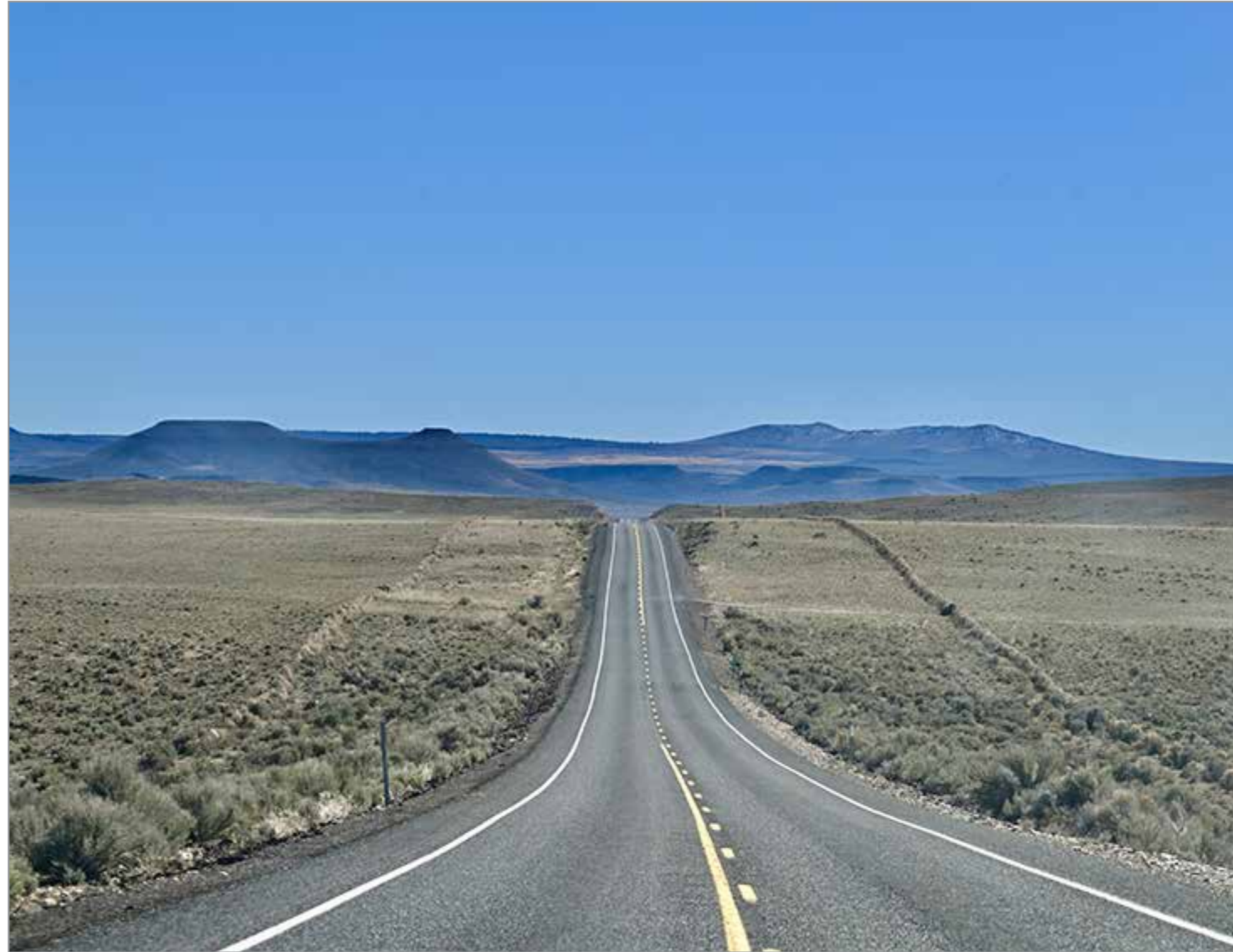
An Ode To Jack Keraouc's On The Road