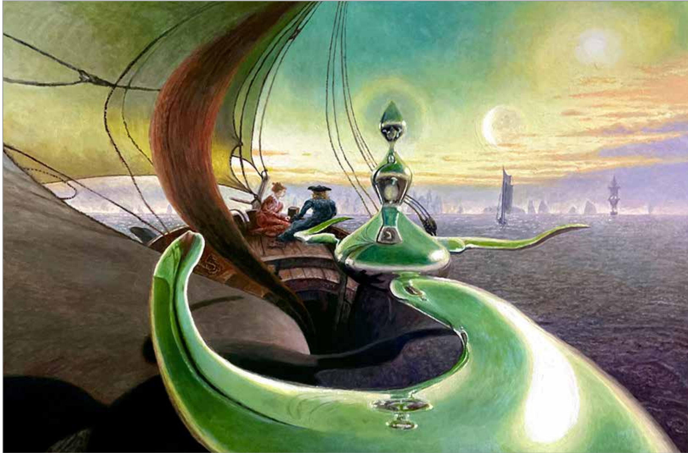
The promise - oil on canvas - 150 x 93 cm