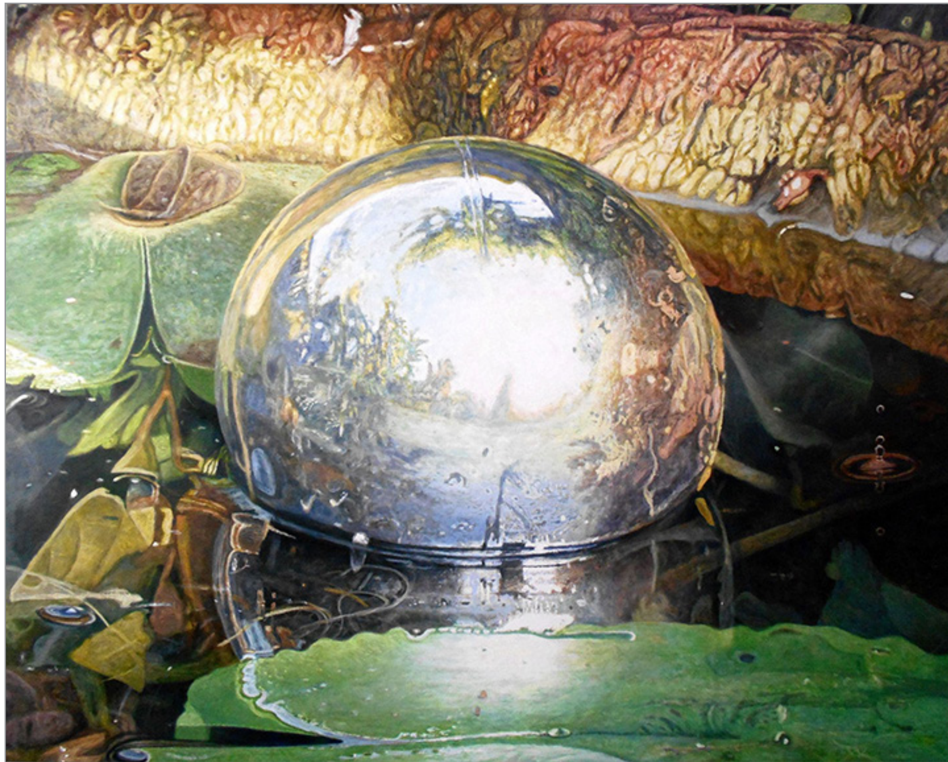
The Drop - Oil on canvas - 180 x 150 cm