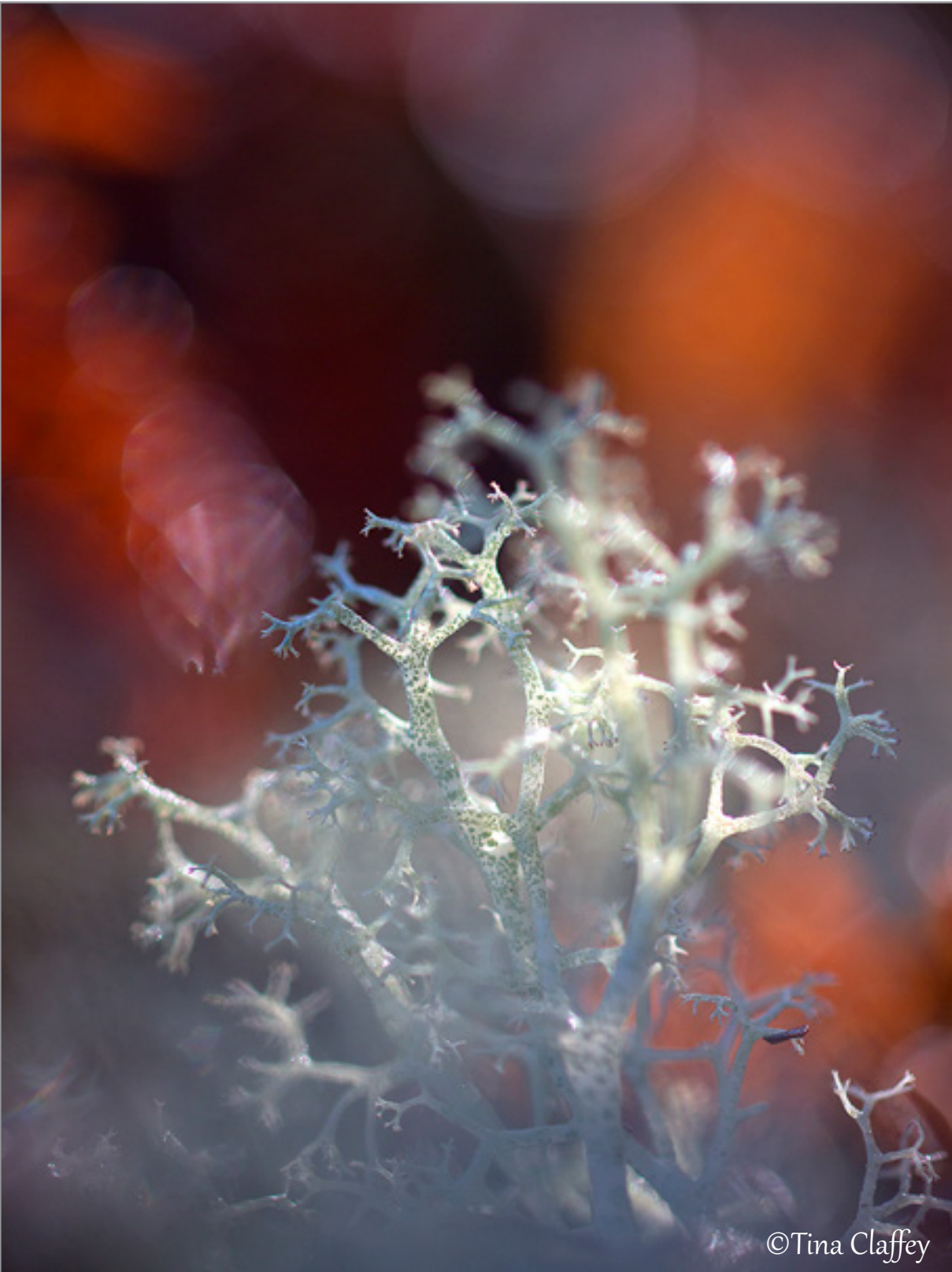
Reindeer Lichen Tree.