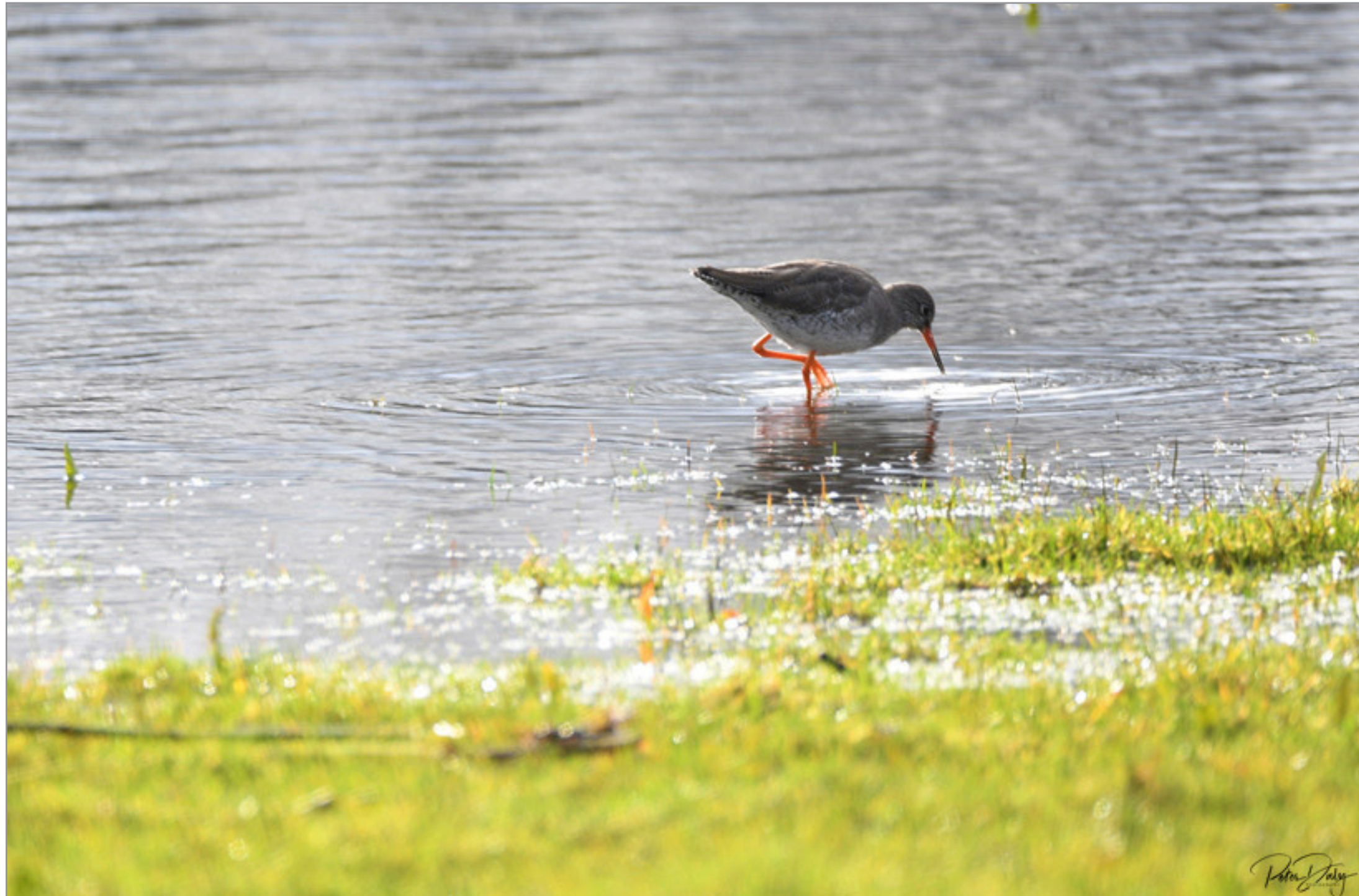
Redshank – Enroute from Iceland to West Africa.