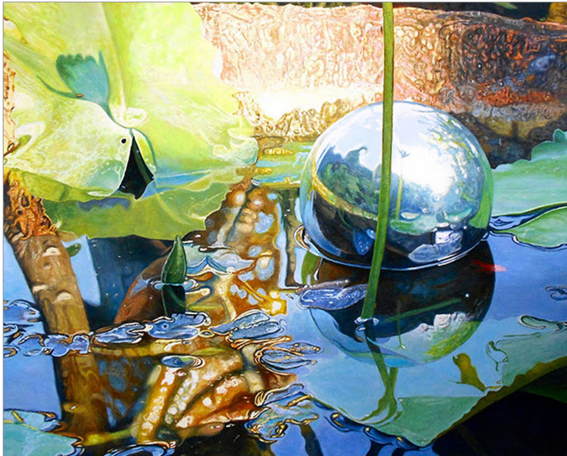
The Shadow - Oil on canvas - 180 x 150 cm