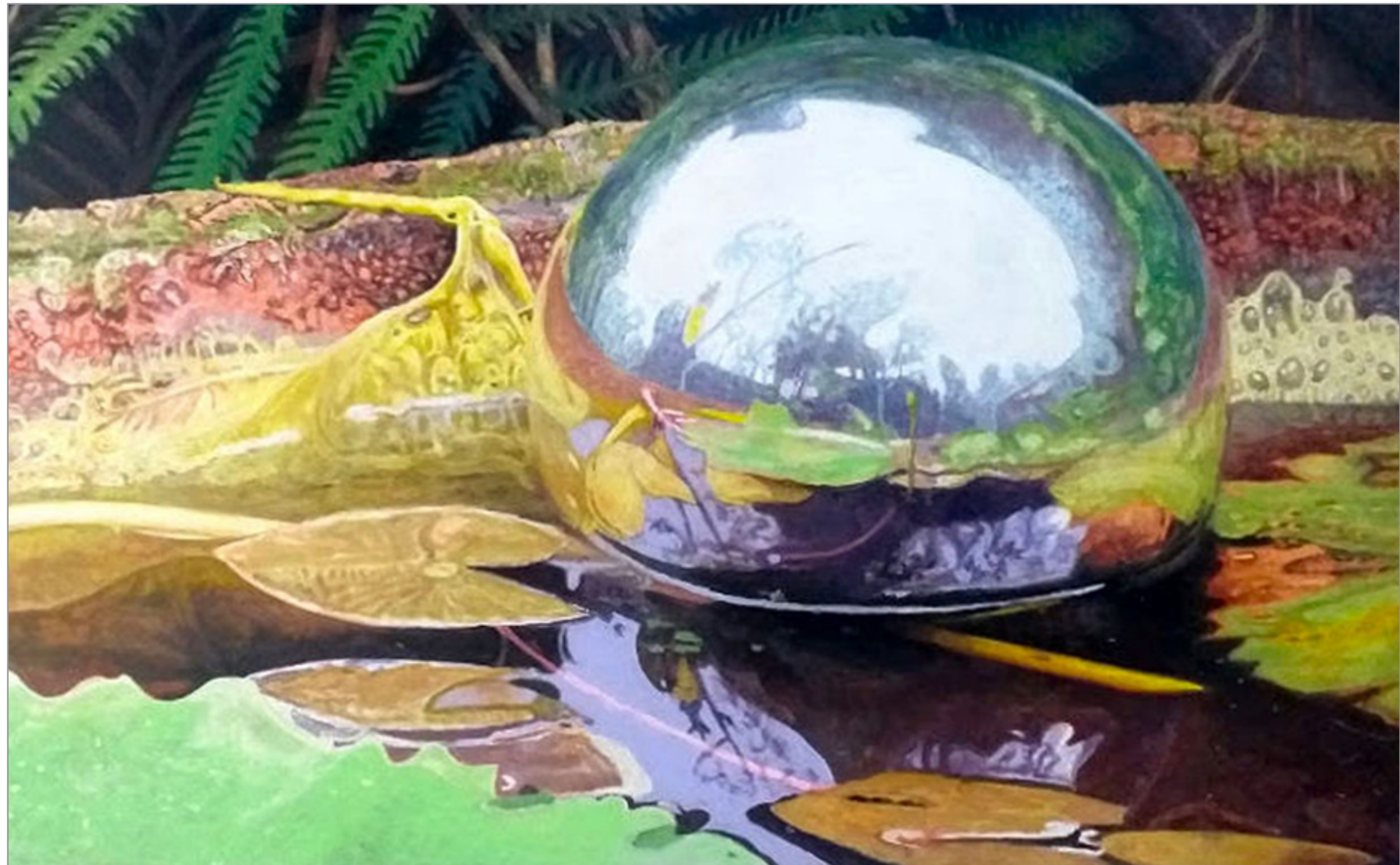
The Temple - Oil on canvas - 160 x 100 cm