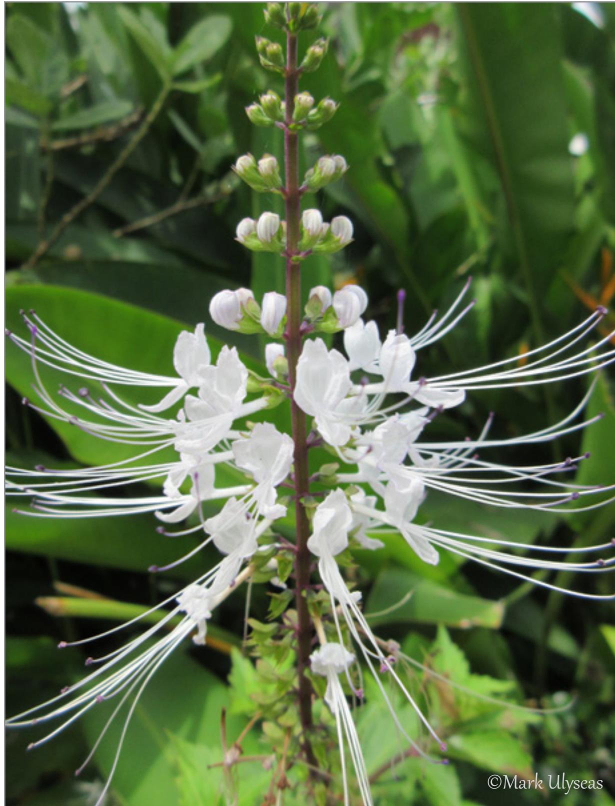
Cat whiskers, Laos.