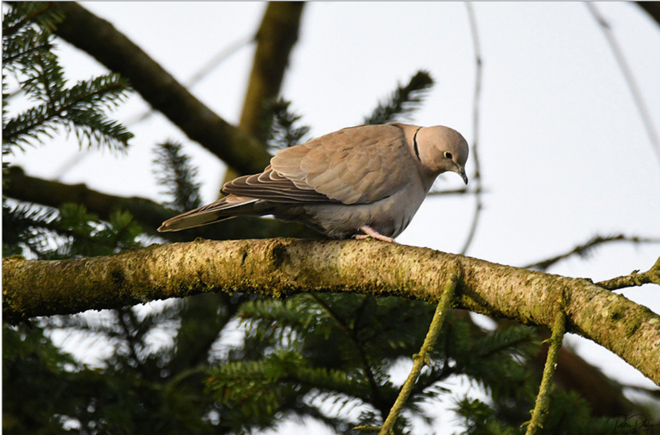
Collared Dove - Resident in towns and villages throughout Ireland.