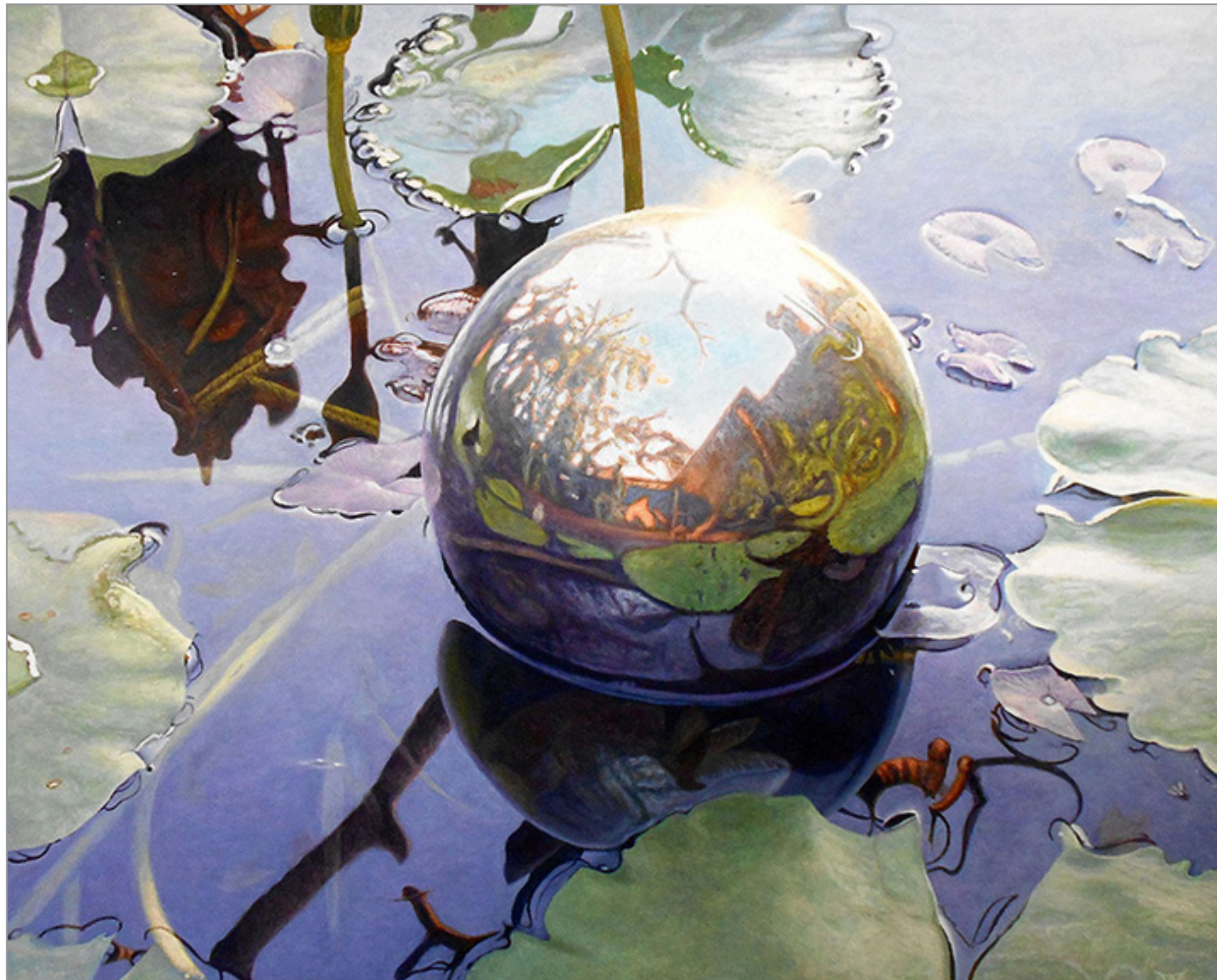
Dawn - Oil on canvas - 180 x 150 cm