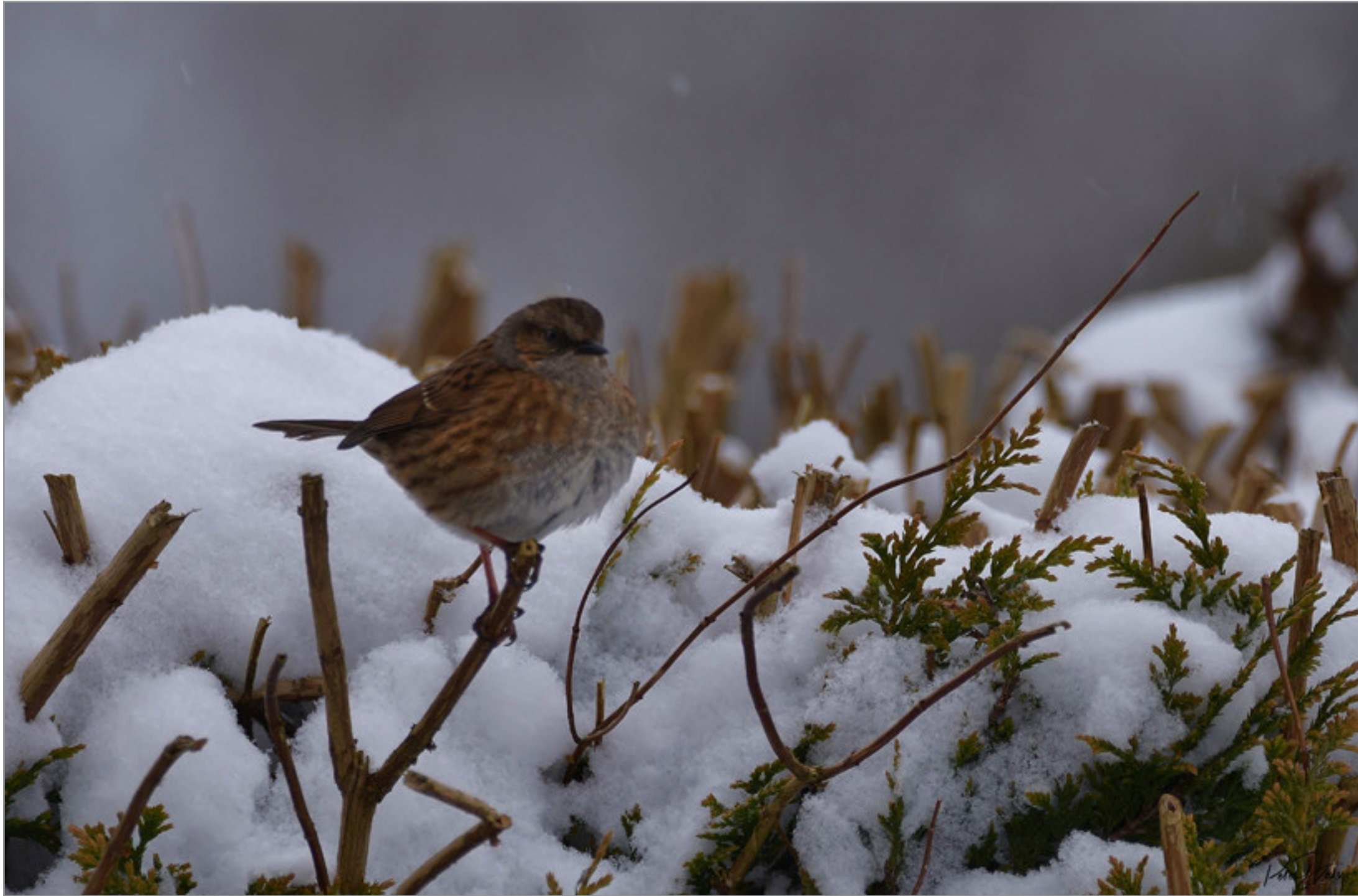
Dunnoek - Common resident throughout Ireland.