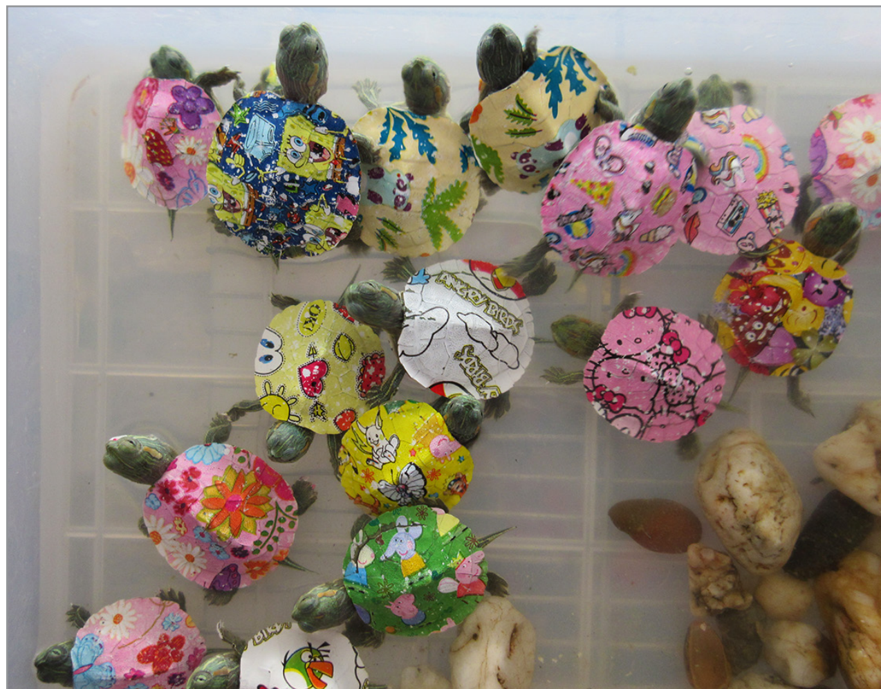
Wild green turtles pasted with colourful transfer stickers for sale to children.