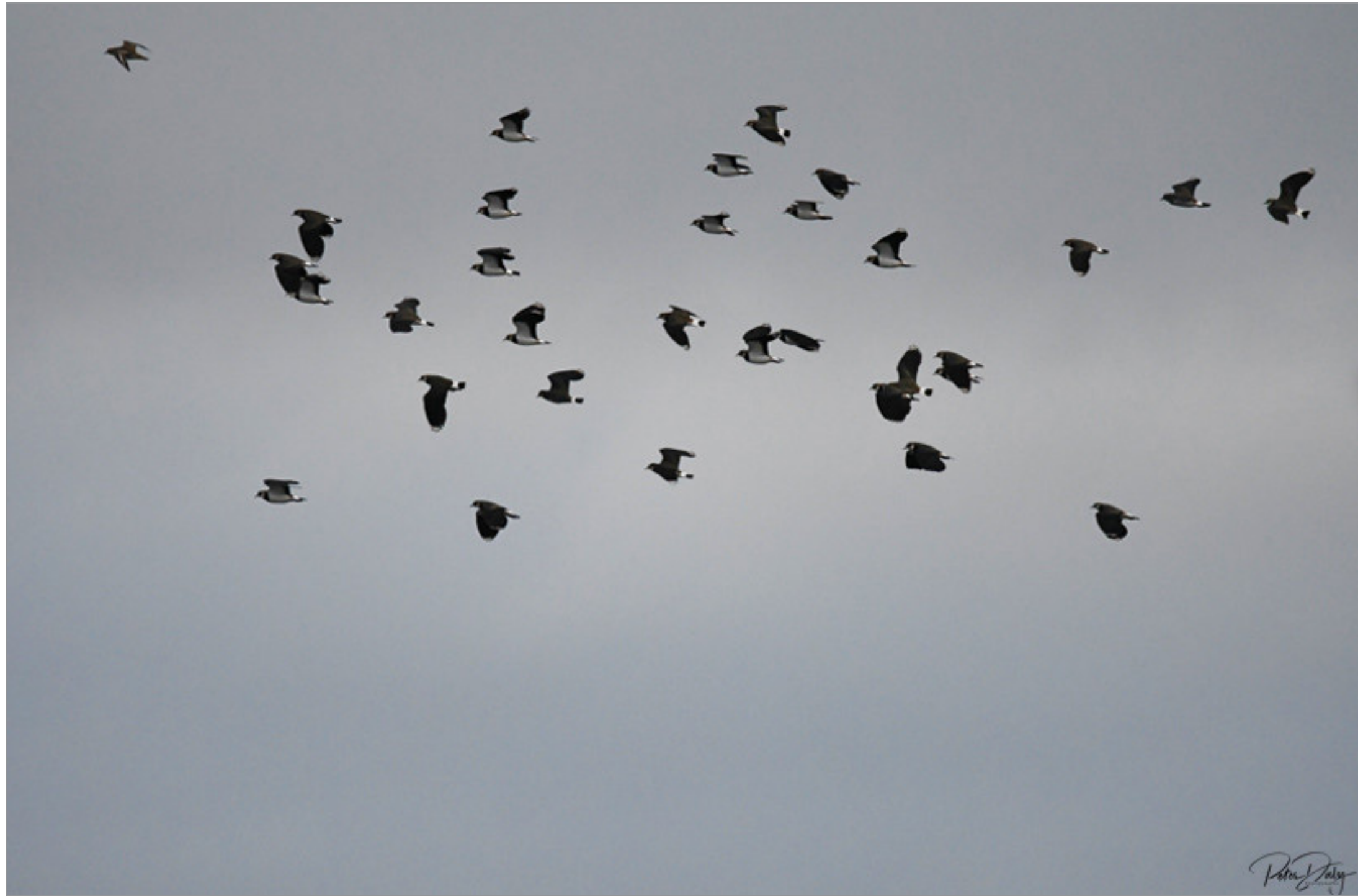
Lapwings - Residents, summer visitors from the Continent (France & Iberia) and winter visitors (from western & central Europe).