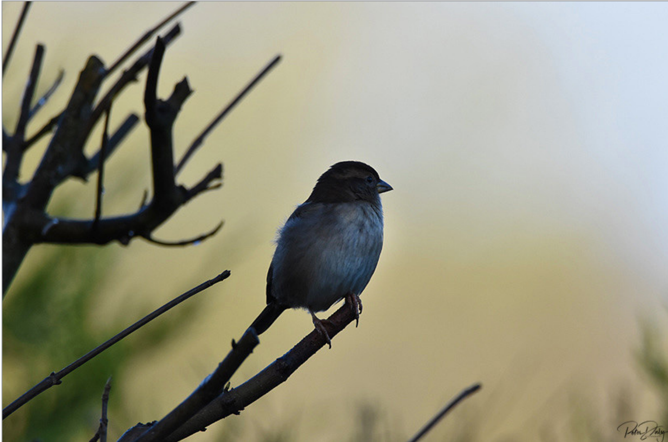
House Sparrow - Resident. One of Ireland's Top 20 most widespread garden birds.