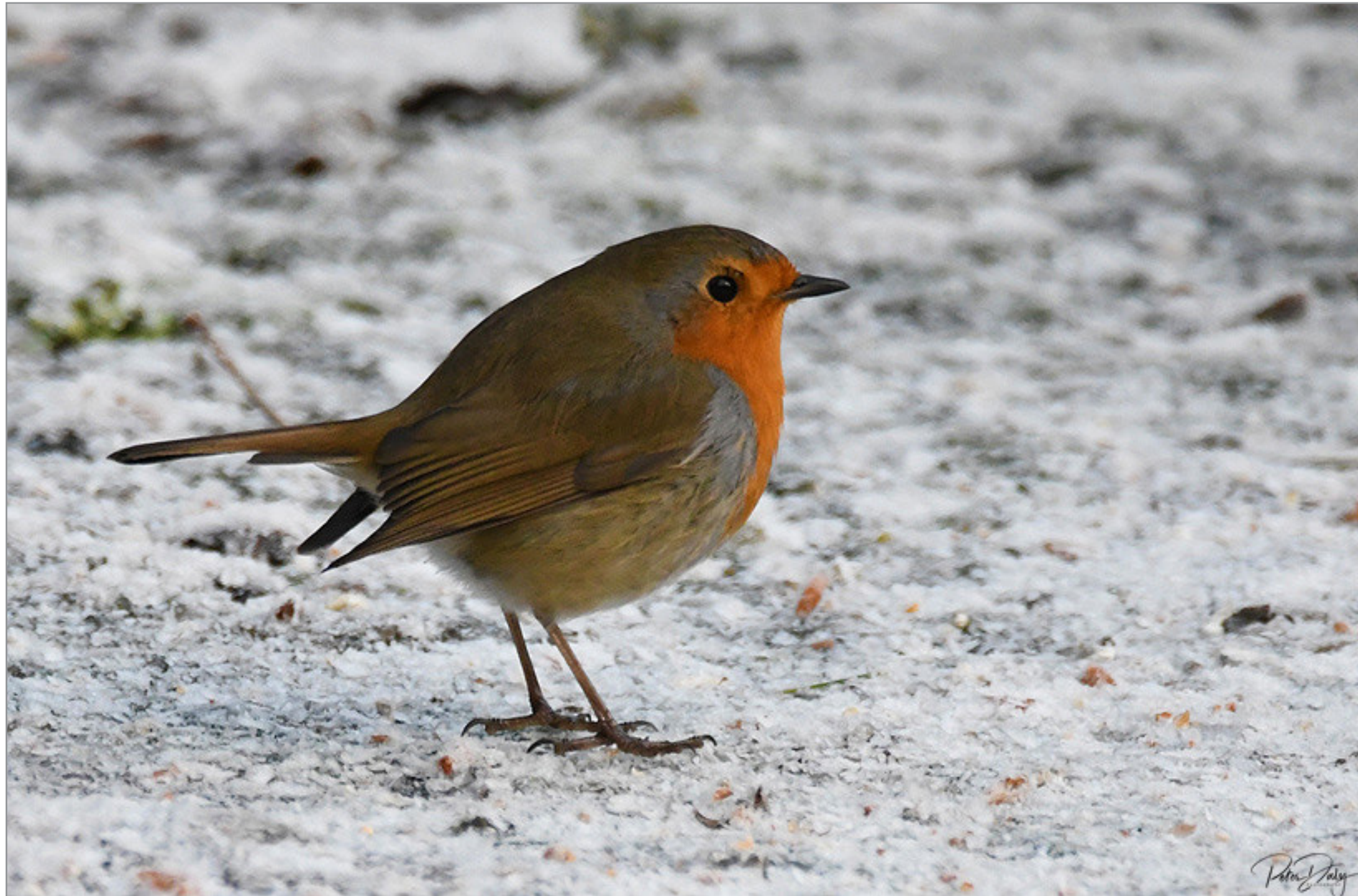
Robin - Resident. Ireland's most widespread garden bird.