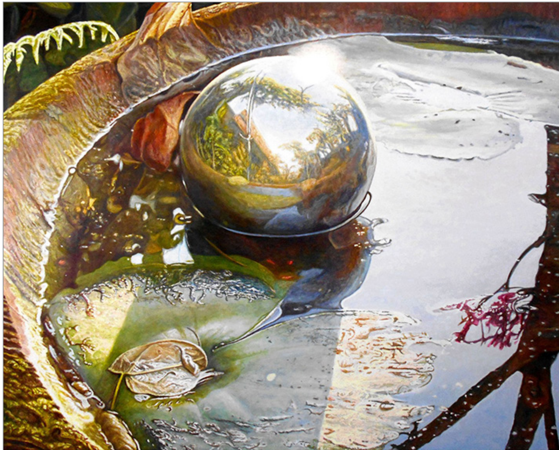
Sunrise - Oil on canvas - 180 x 150 cm