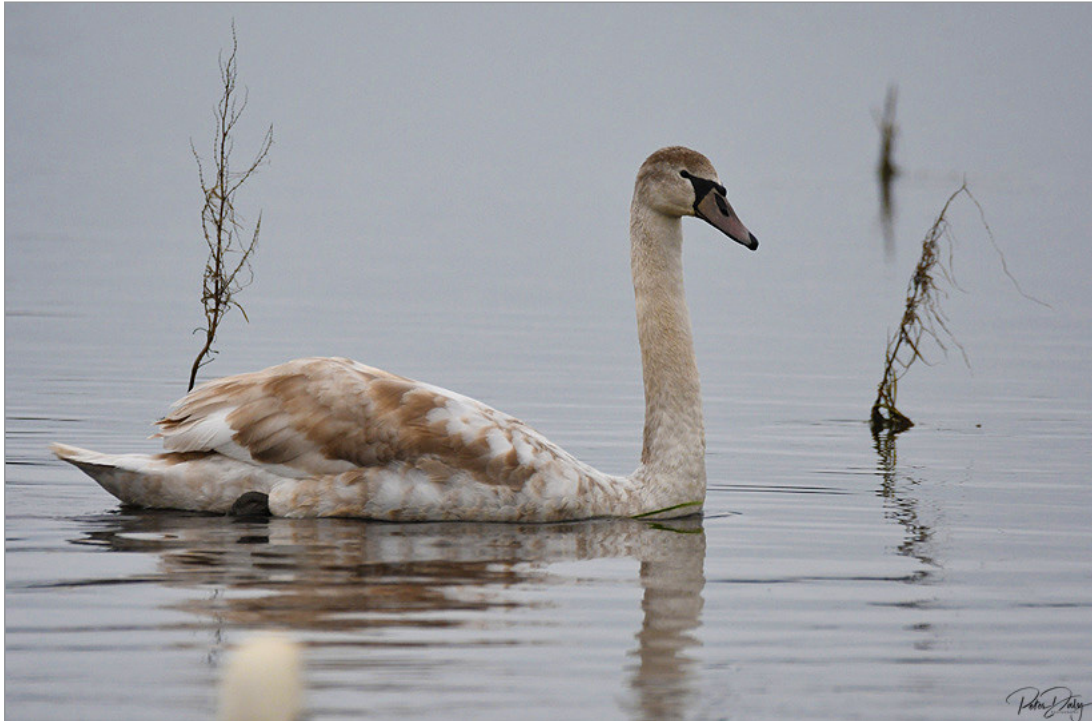
Young Swan - Winter visitor to wetlands throughout Ireland from October to April.