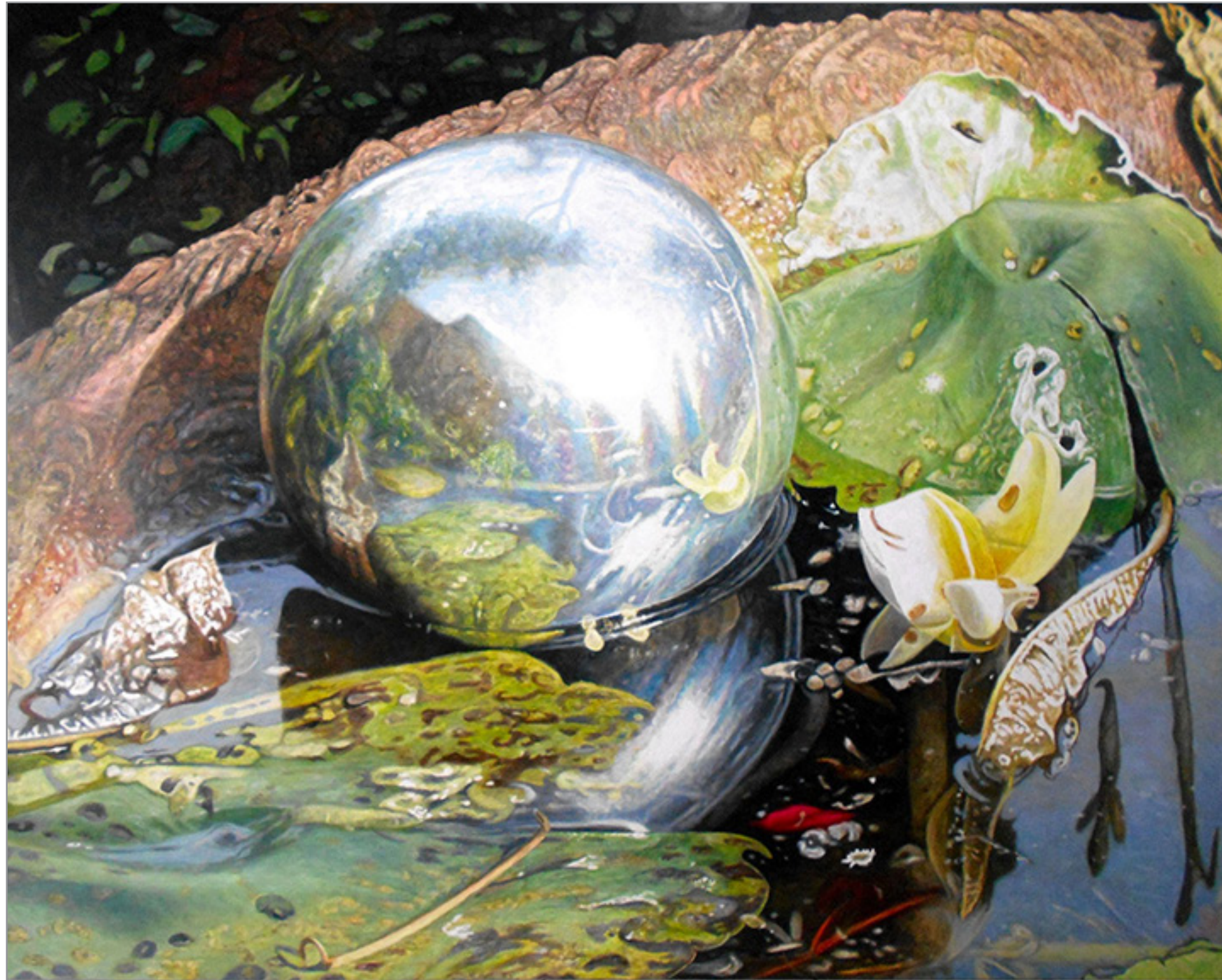
Rainbows - Oil on canvas - 180 x 150 cm