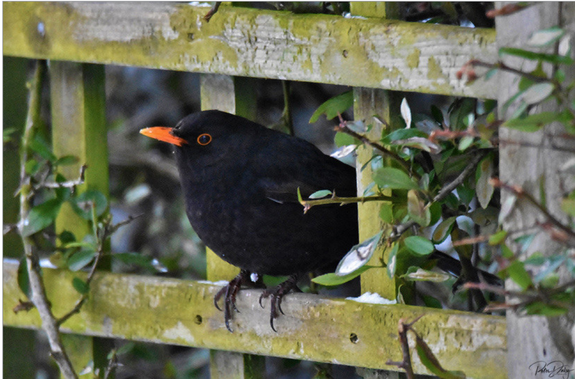
Blackbird - Resident, and winter visitor from Norway.