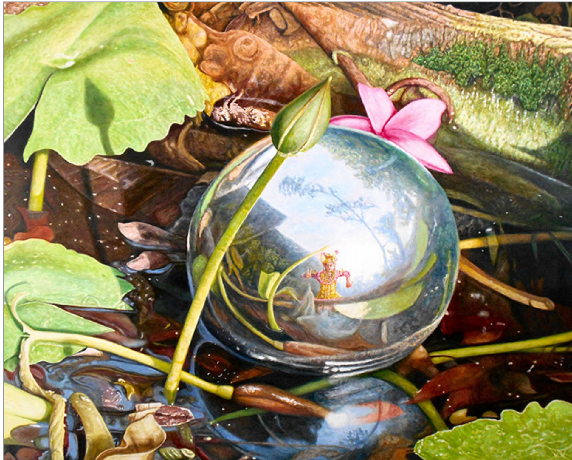
Dancing in the afternoon - Oil on canvas - 180 x 150 cm