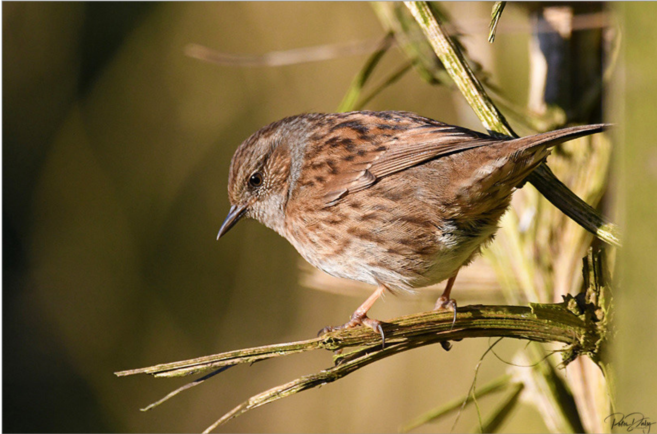
Dunnoek - Common resident throughout Ireland.