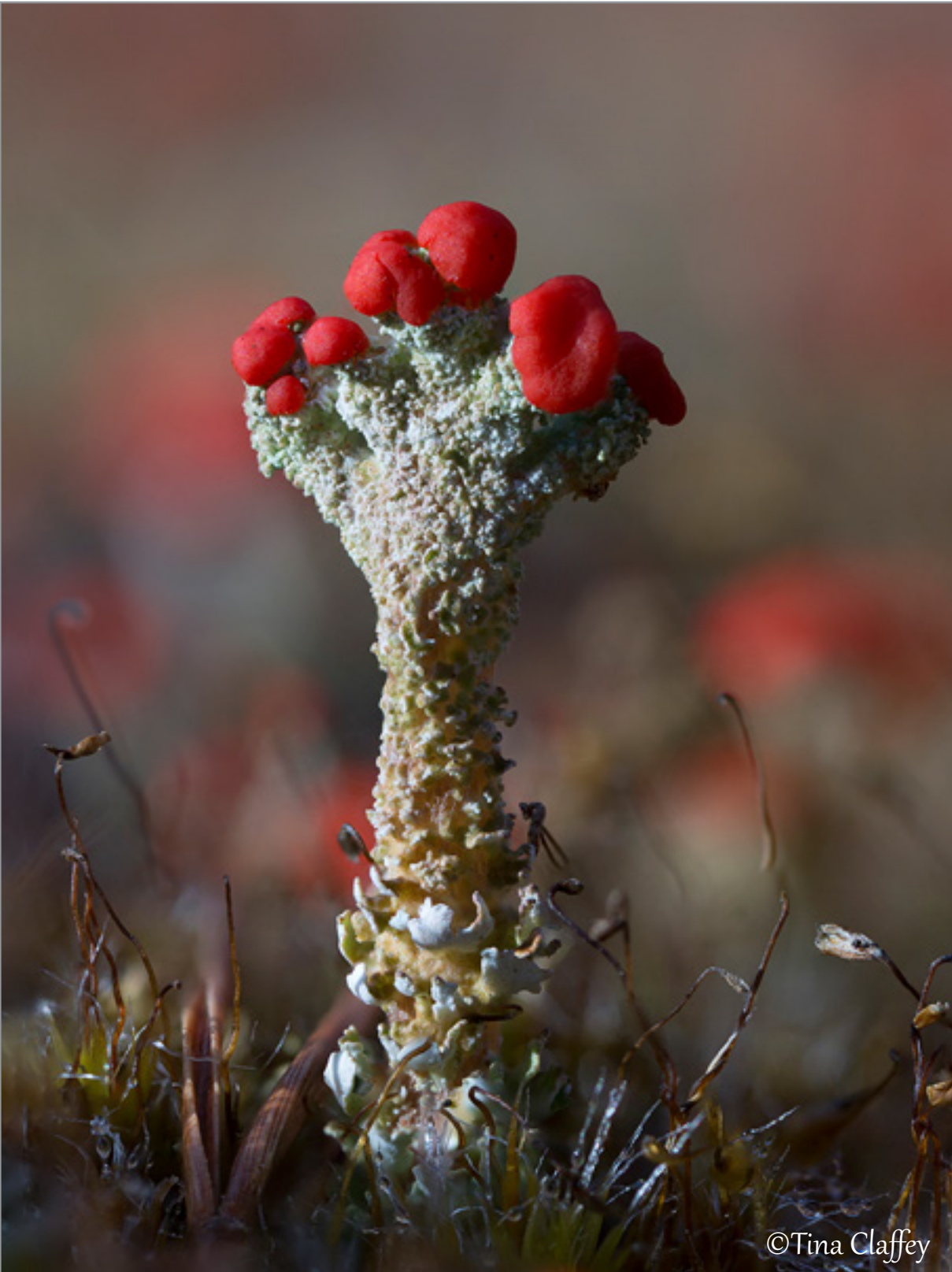
Devil’s Matchstick Tree.