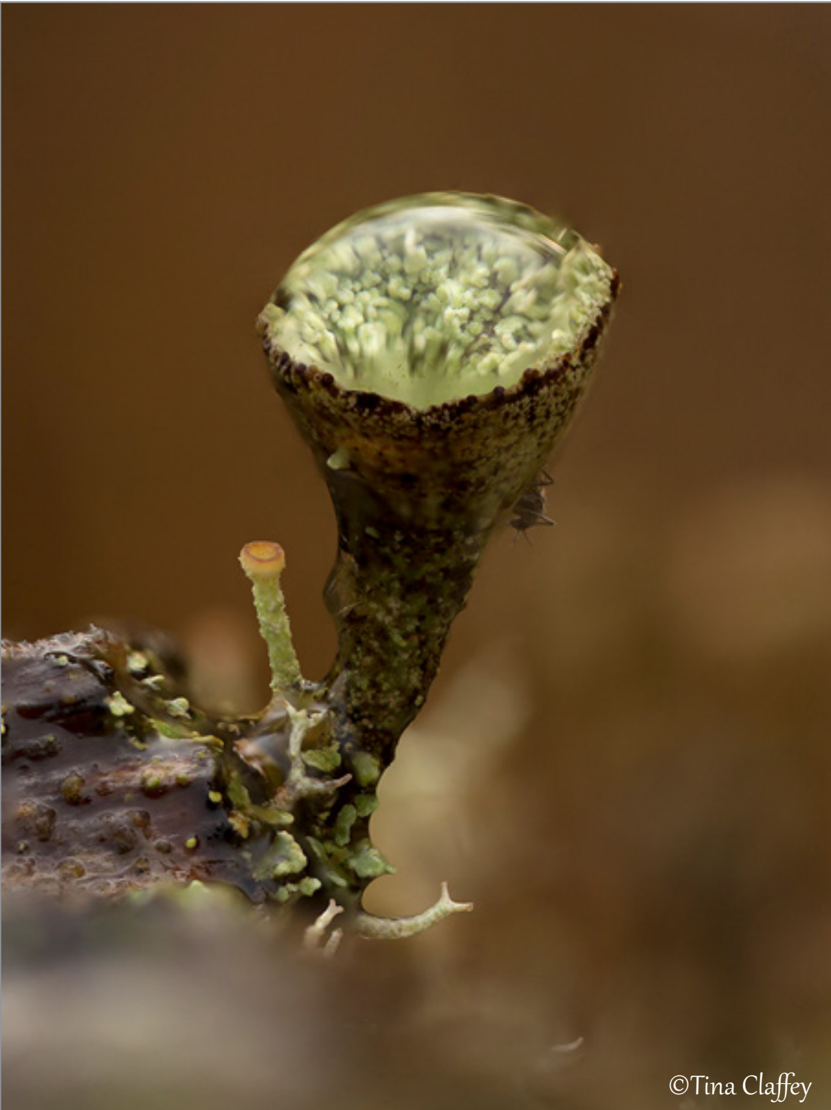
Pixie Lichen World of Dew.