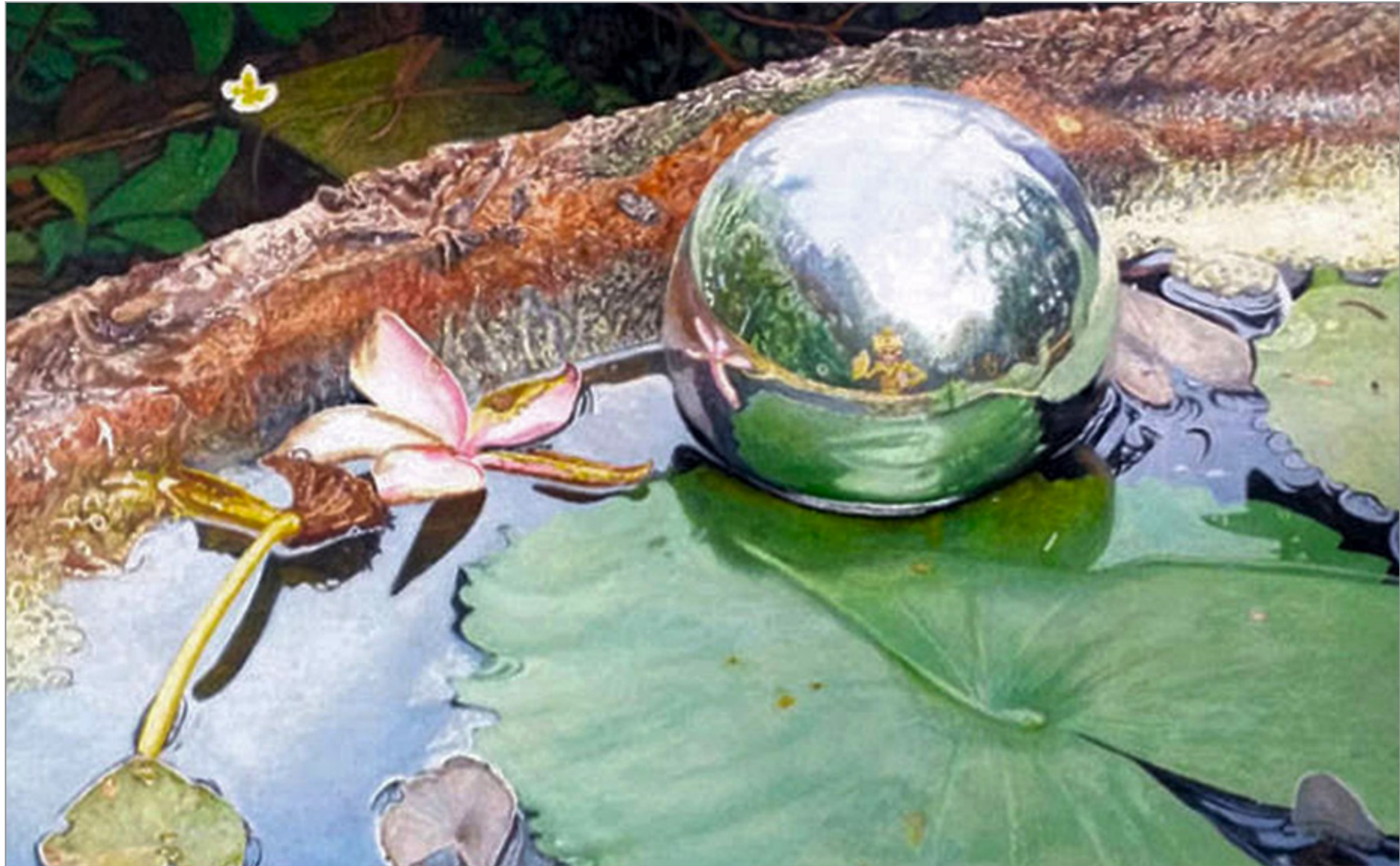
Dancing on a cloudy day - Oil on canvas - 160 x 100 cm