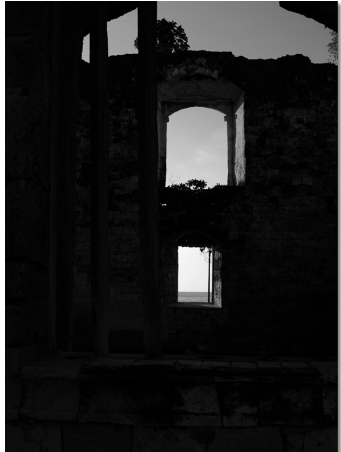
Cuartel (Spanish barracks) ruins overlooking the Bohol Sea.

On the south end of the island, about four hours by bus from Cebu City, lies the village of Oslob Poblacion. Exactly 494 years, to the month, after Magellan met his fate, I stepped back-in-time onto the hot, dusty streets of Oslob. It is an enchanted place where one can still witness men in their outriggers fishing the rich offerings of the sea and women bringing their husbands' catch to market or into their kitchens for the family supper.