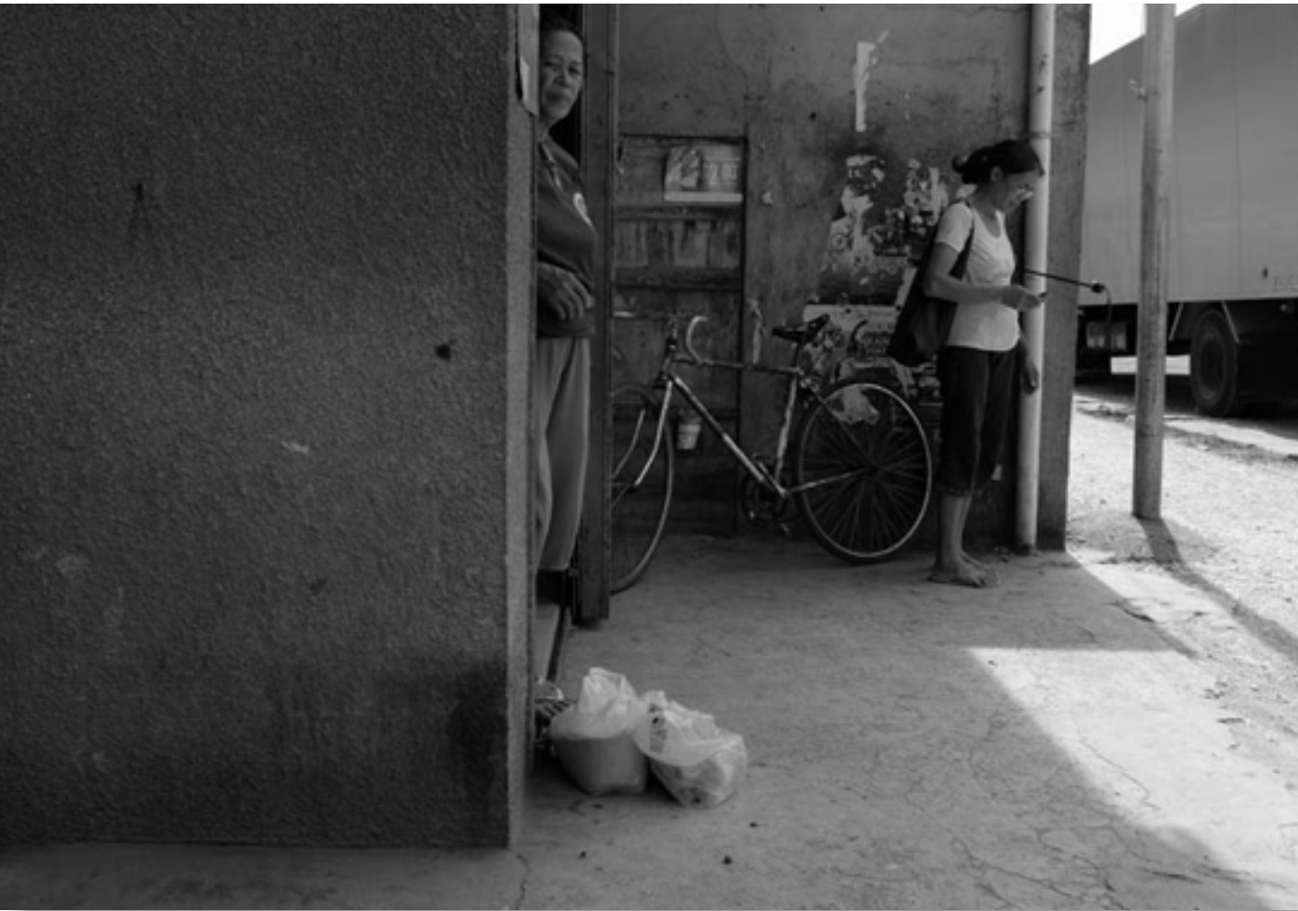
Main entrance to Oslob’s largest general store.