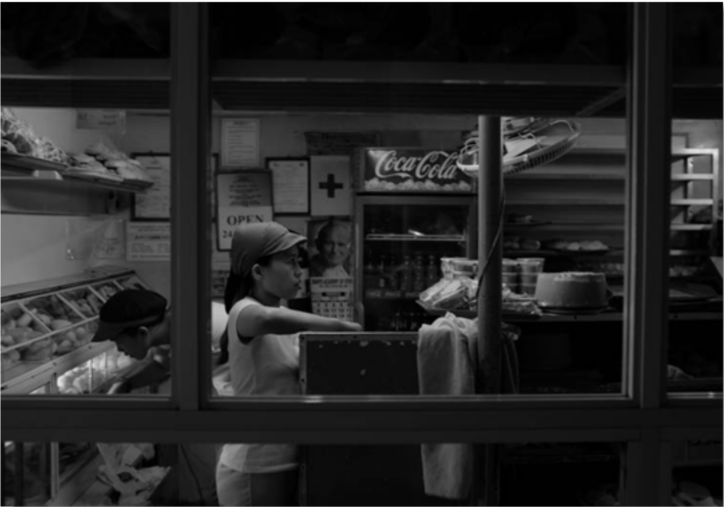
Morning rush hour at Julie’s Bakery.