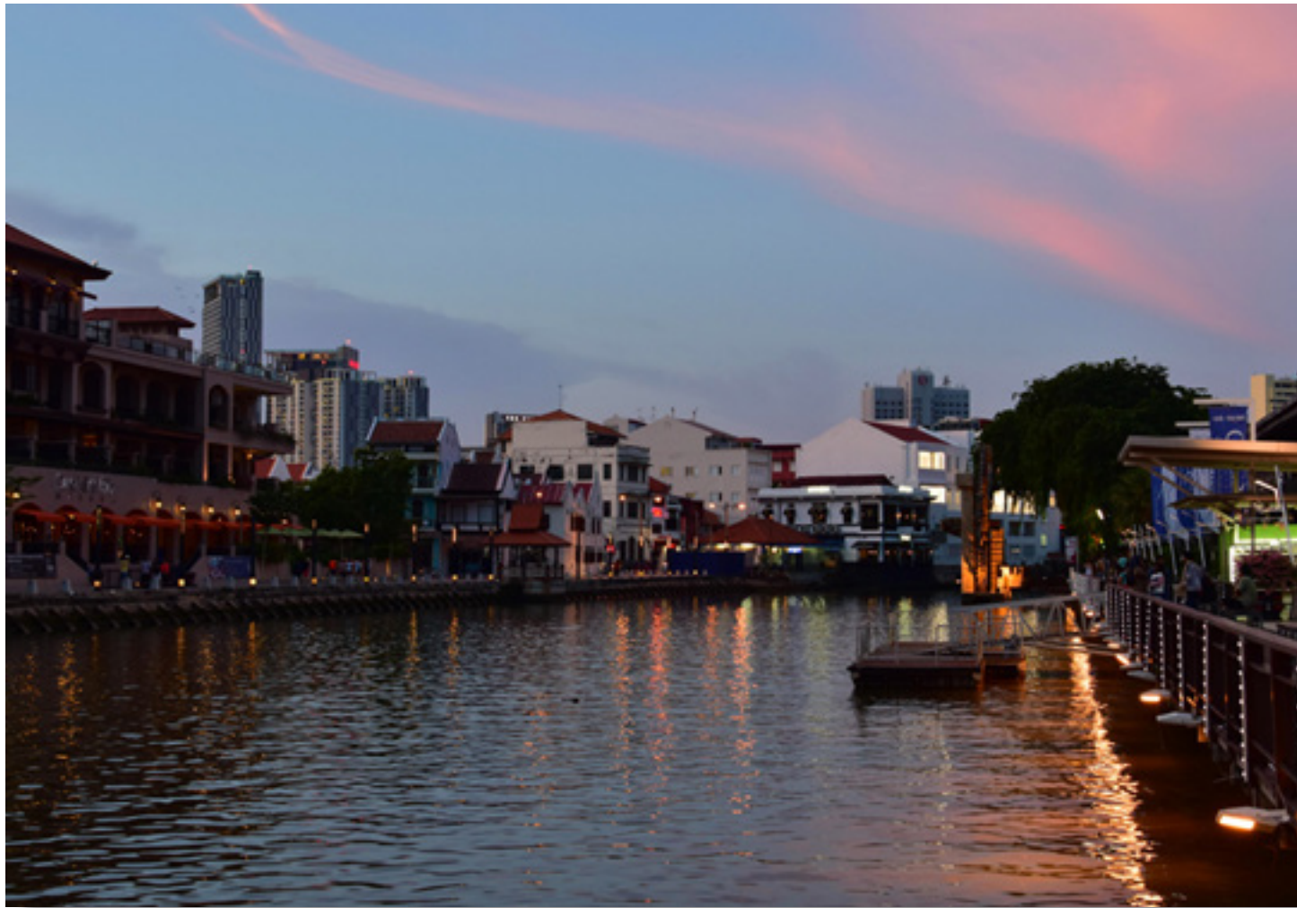
The Melaka River cuts across Melaka town on its way to the Straits of Malacca.