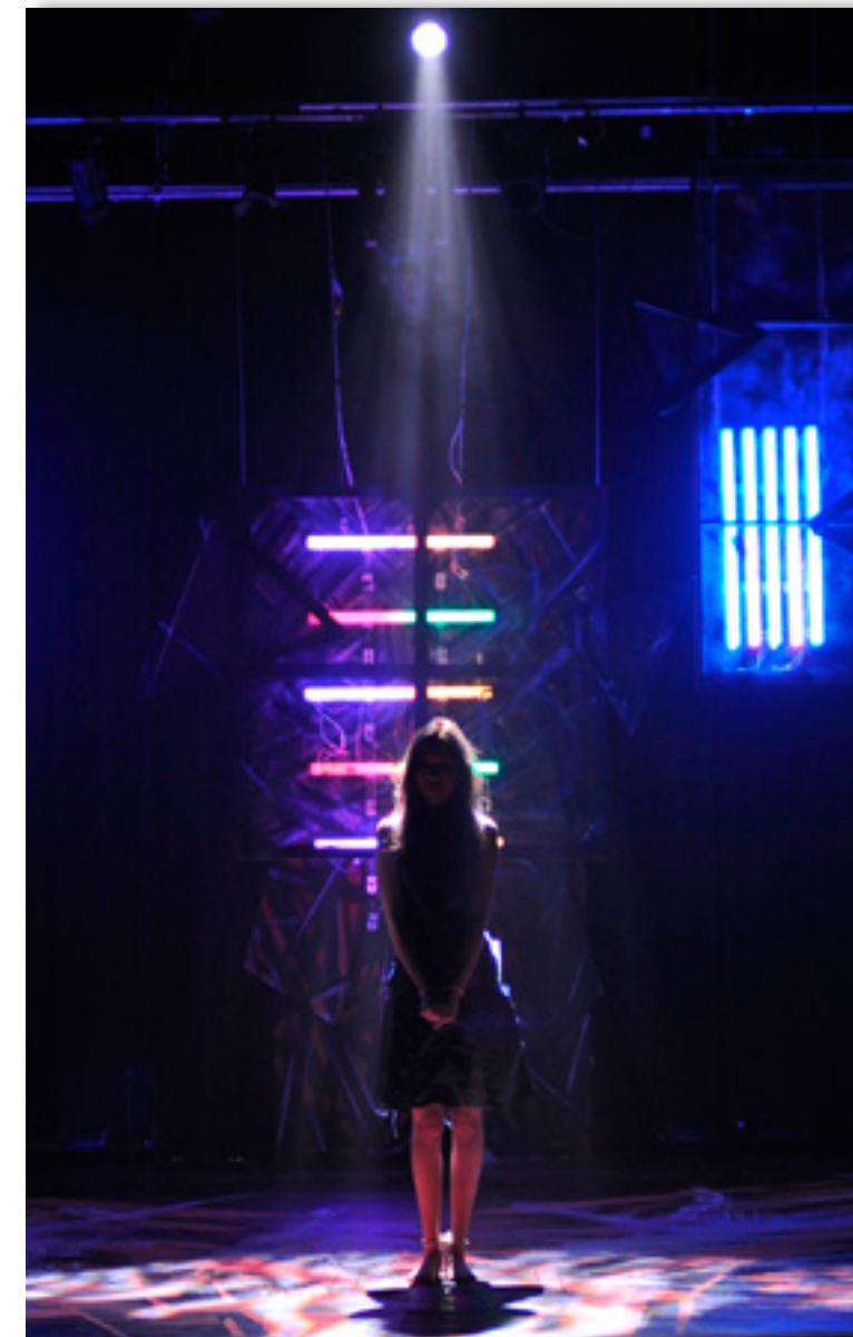
Matschoss’s contemporary version of Shakespeare’s Midsummer Night’s Dream.

It is therefore helpful I think to point out that the processes of creativity parallel those of learning. Recent calls for authentic activities, teaching for understanding, and real-world problem solving all require engaging students with content in flexible and innovative ways. Students who use content in creative ways learn the content well. They also learn strategies for identifying problems, making decisions, and finding solutions both in and out of school. Classrooms organized to develop creativity become places of both learning and wonder, a places that generates a sort of curious delight. Early in 2011 I was part of an event in Perth, aptly titled ‘Stories under the Night sky’. It was all about re-capturing the essence and beauty of this ‘dying’ art-form.