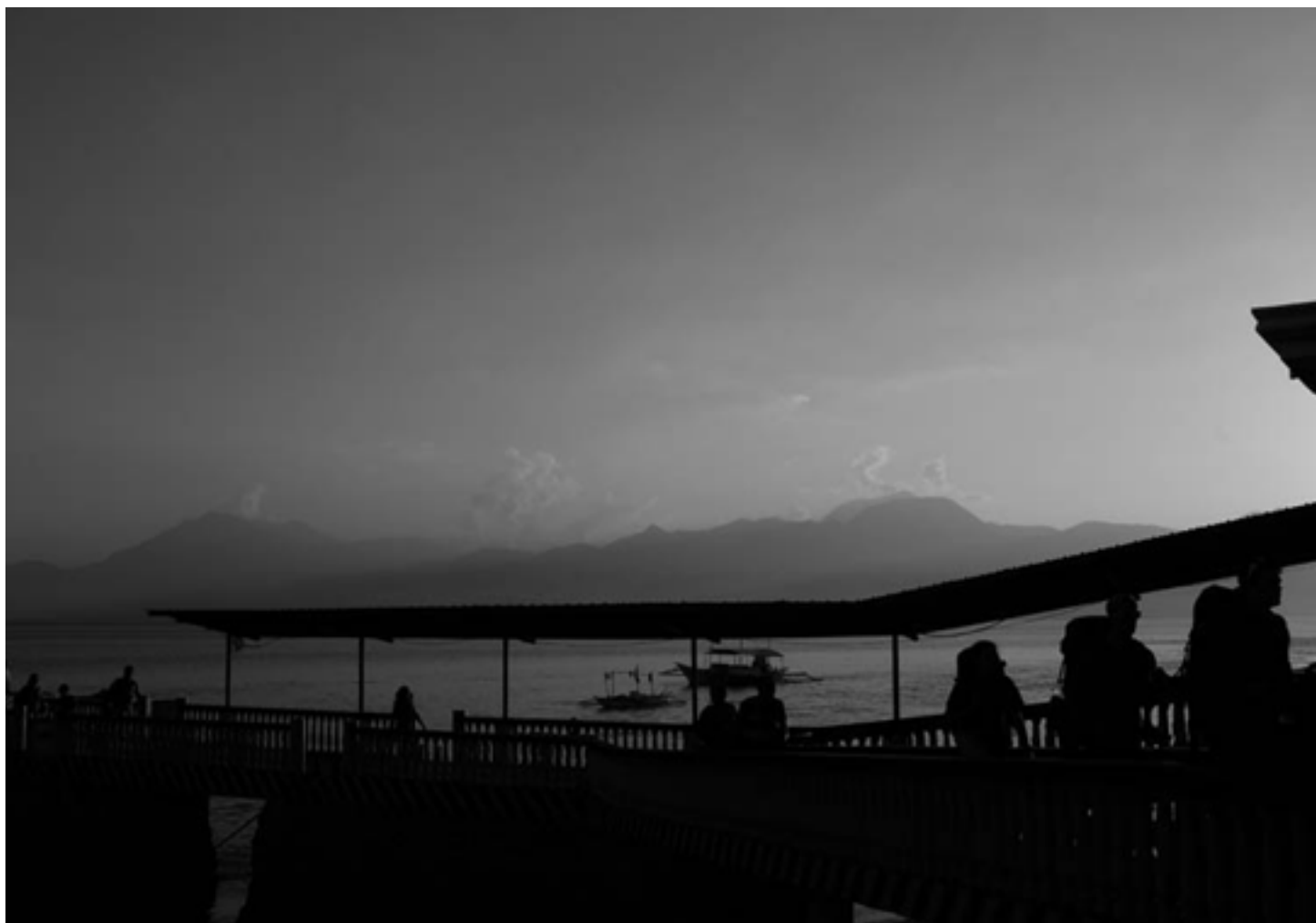
Passengers disembark at Liloan Port Santander, Cebu.