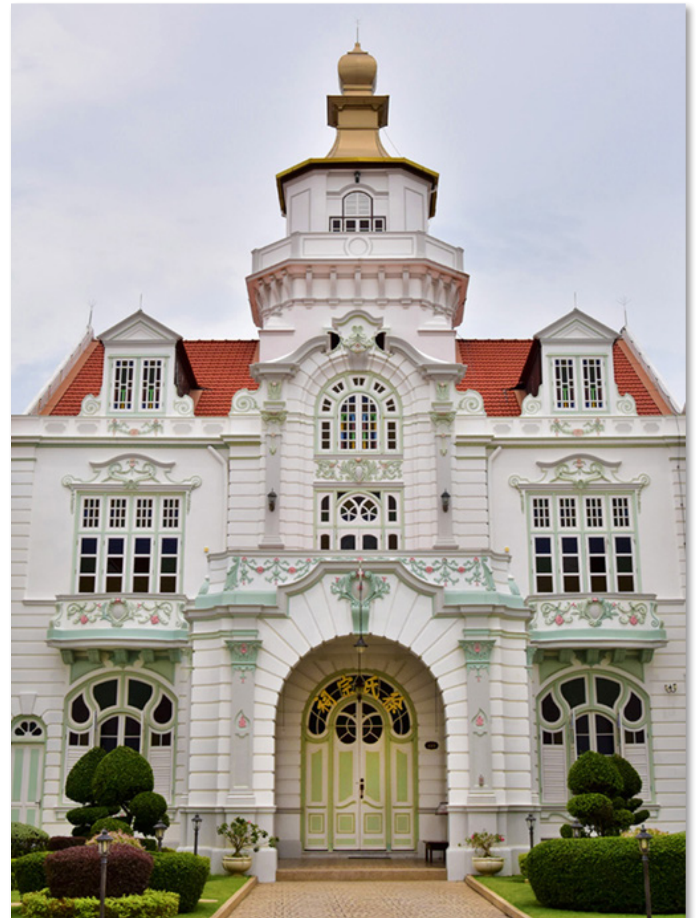
The Chee Ancestral Mansion, designed by J.E.Westerhout is a mix of architectural styles – Chinese, Portuguese, Dutch and English. The mansion was built in 1925 in honour of Chee Yam Chuan, a prominent Baba businessman whose ancestry in Melaka dates back to the early 18th century.