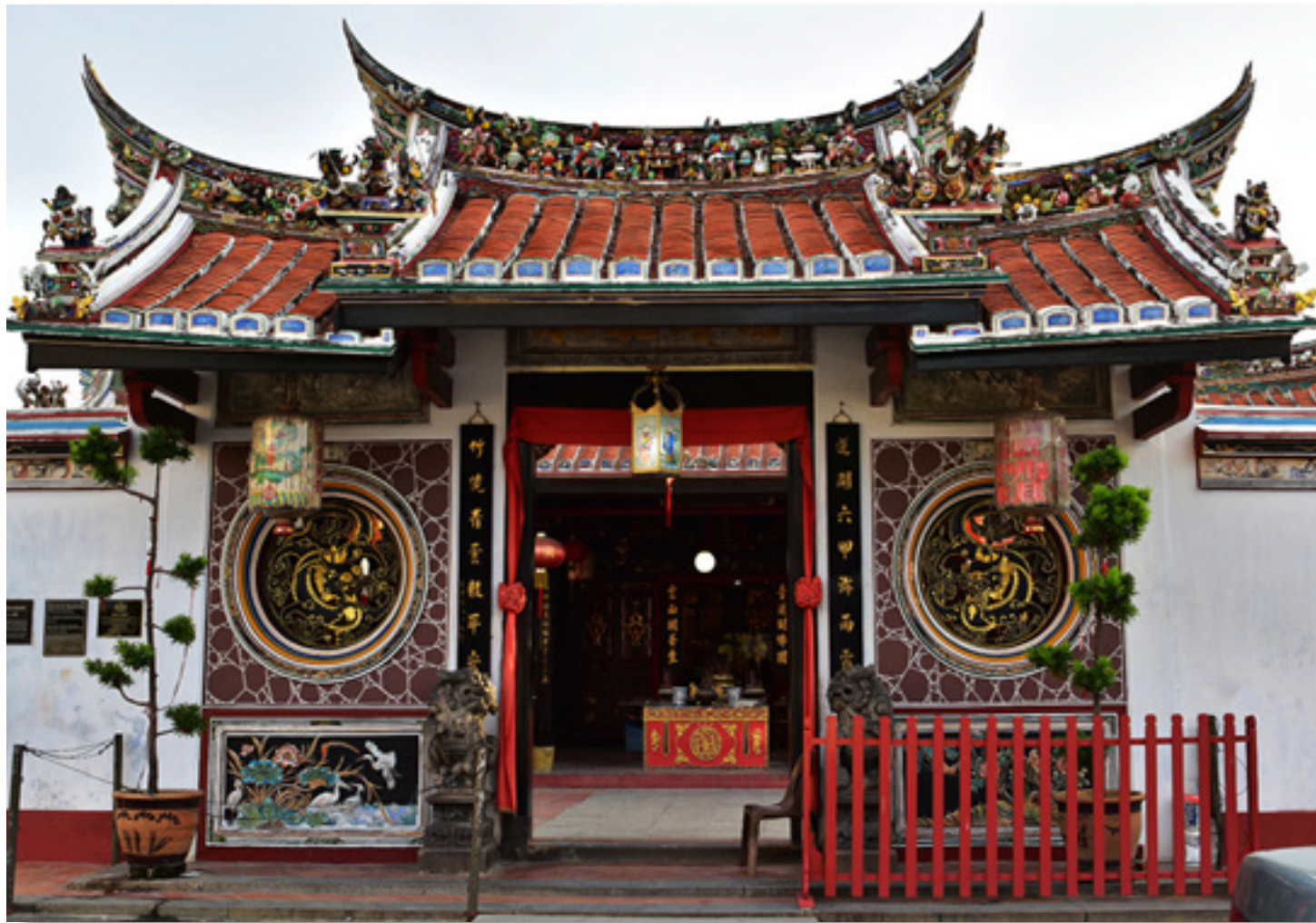
Chen Hoon Teng Temple: The prayer rituals that you will observe in the temple have been practiced in Melaka since the Chinese first settled here. Constructed in 1673, Cheng Hoon Teng, or Green Clouds Temple, is the oldest functioning temple in the country. Dedicated to Kwan Yin, the Goddess of Mercy, it is devoted equally to the three doctrines – Taoism, Confucianism and Chinese-Buddhism. Every aspect of the temple tells a story about the Chinese in Melaka, their lives, their beliefs and their concerns.