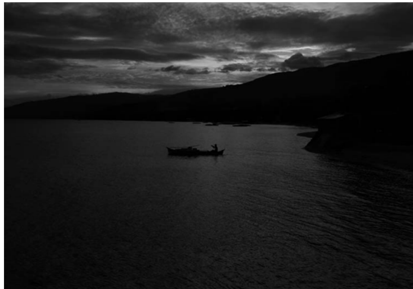
A fisherman in a traditional banca outrigger at sunset.