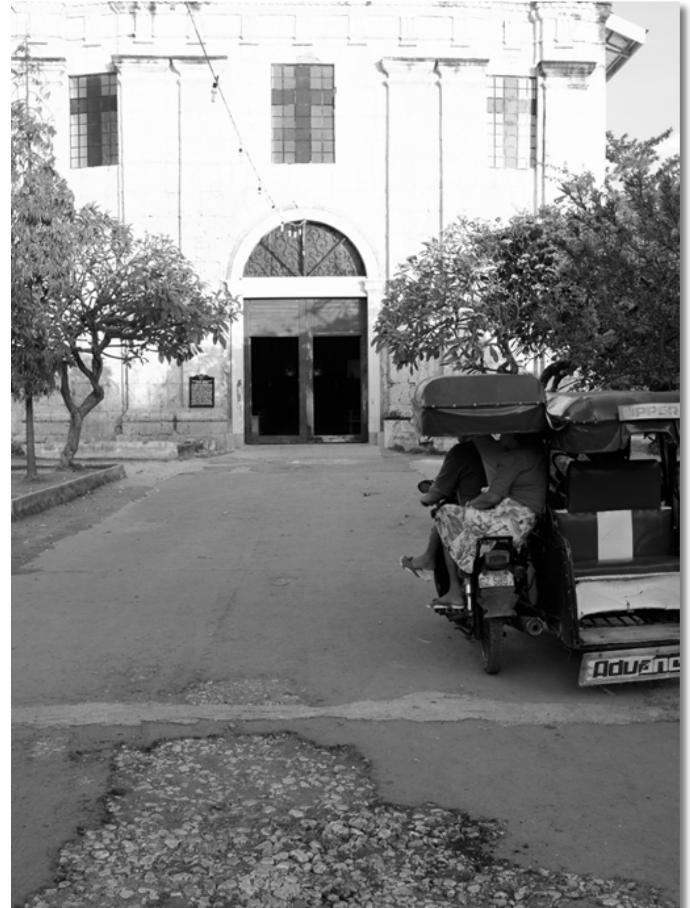
A motorized tricycle waits at the Church of the Immaculate Conception.