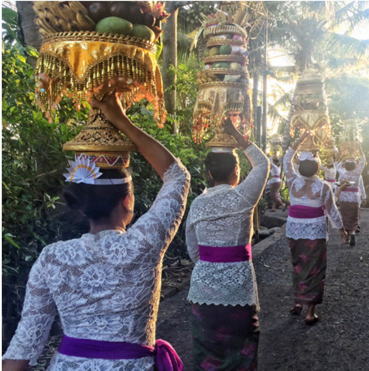
Offerings in the sunset.