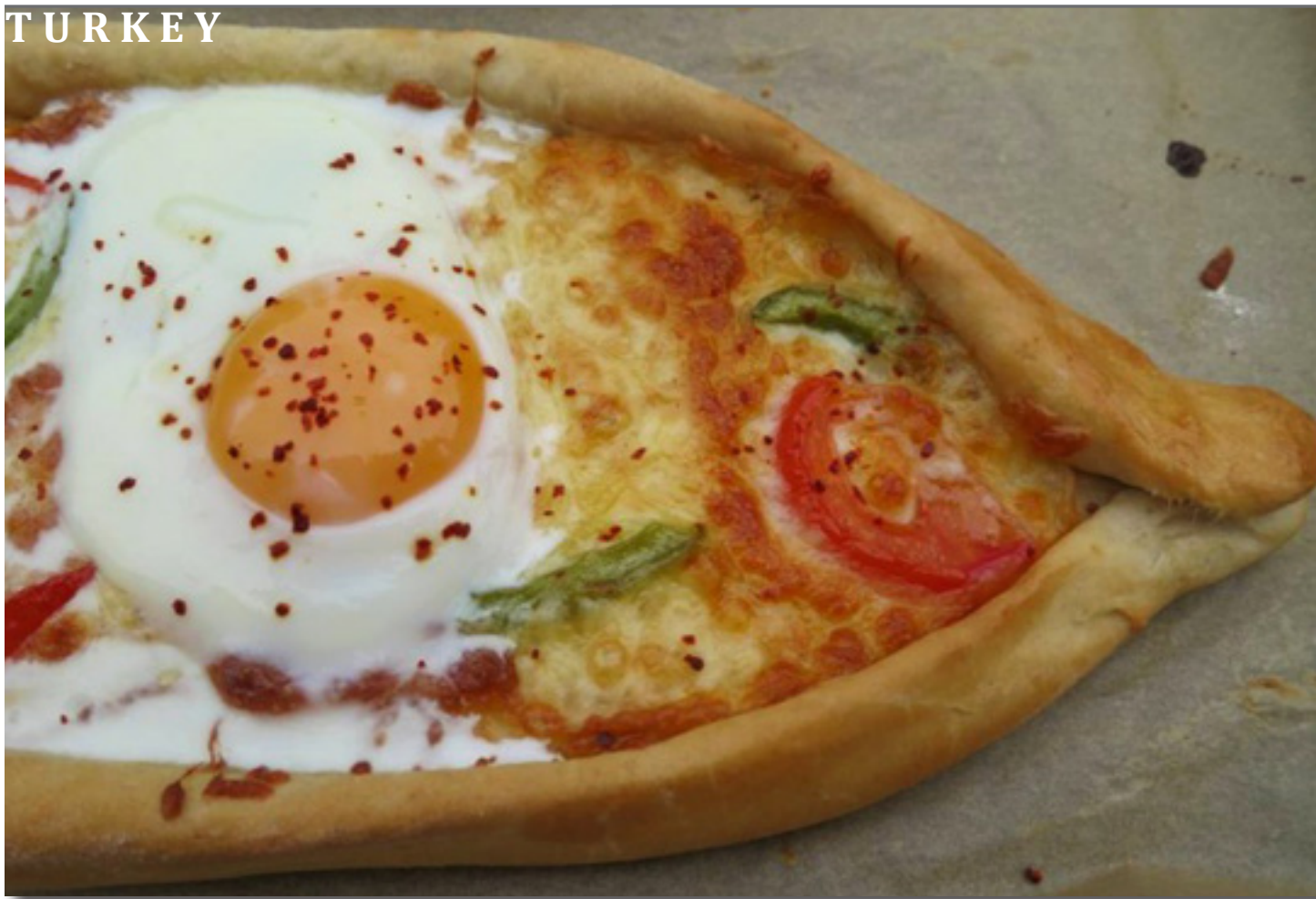
Pide, Turkish flat bread with cheese, pepper, tomato with a cracked egg, Kayseri Style