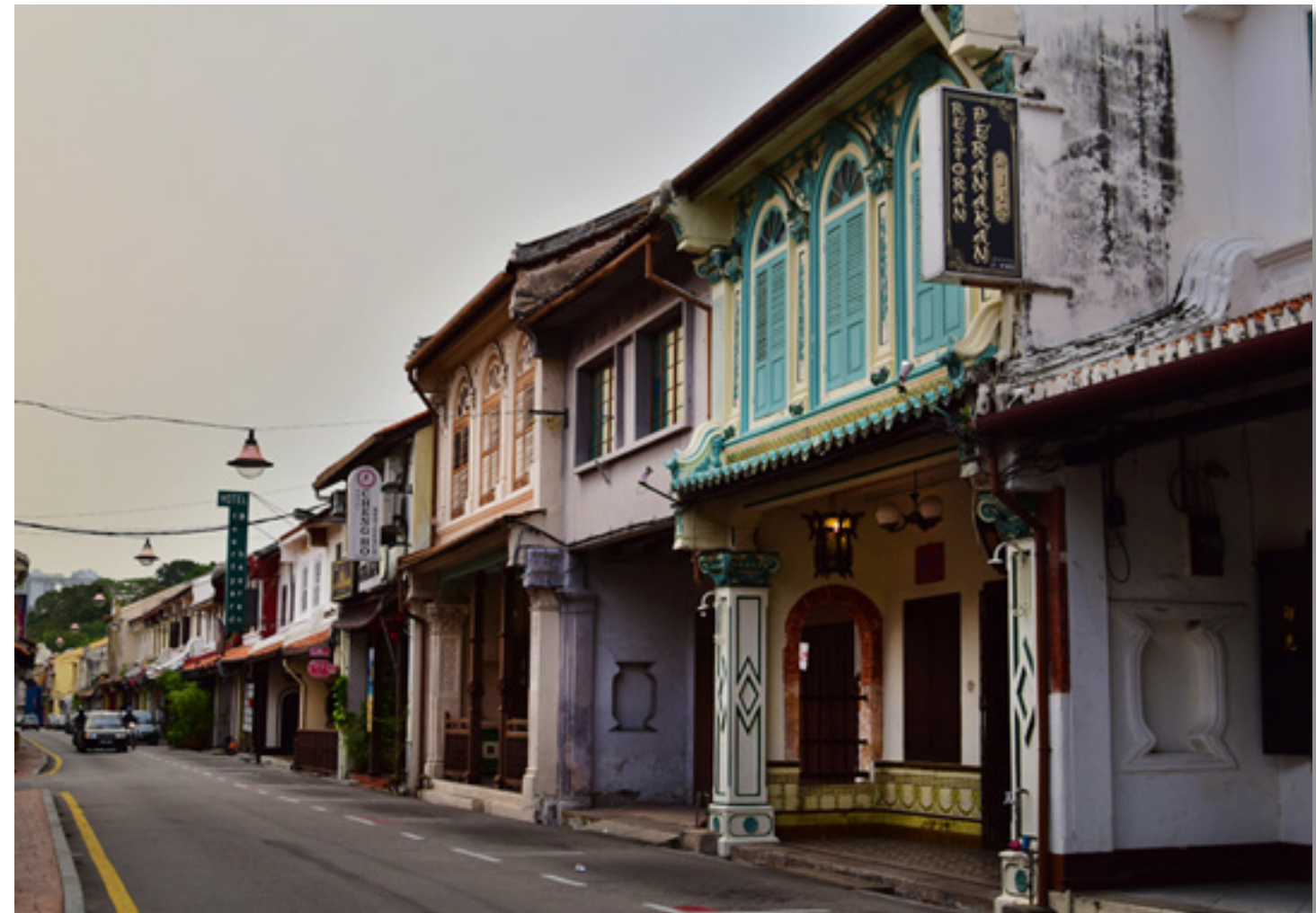
Jalan Tun Tan Cheng Lock before the morning rush.