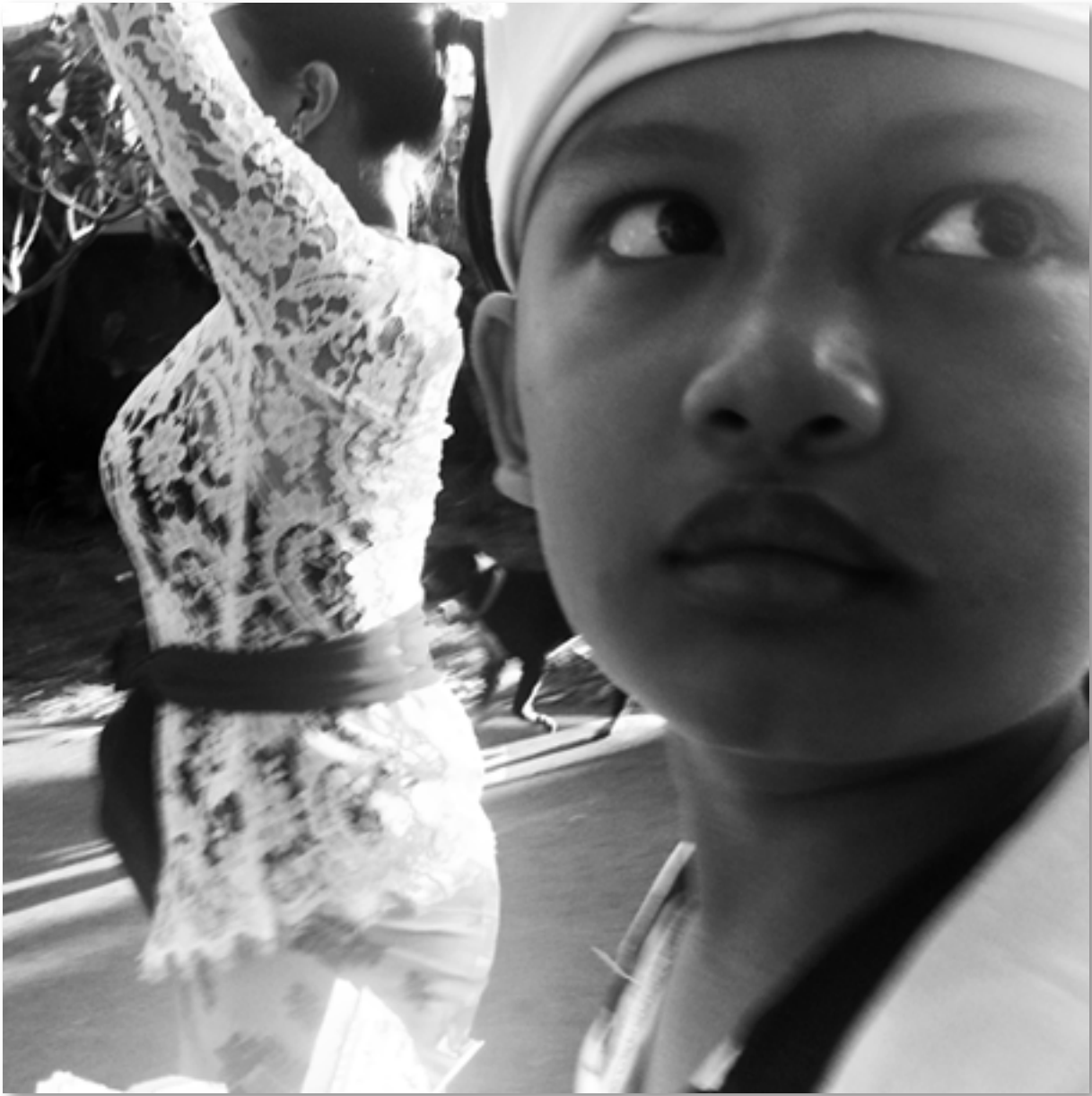
Face of a boy.