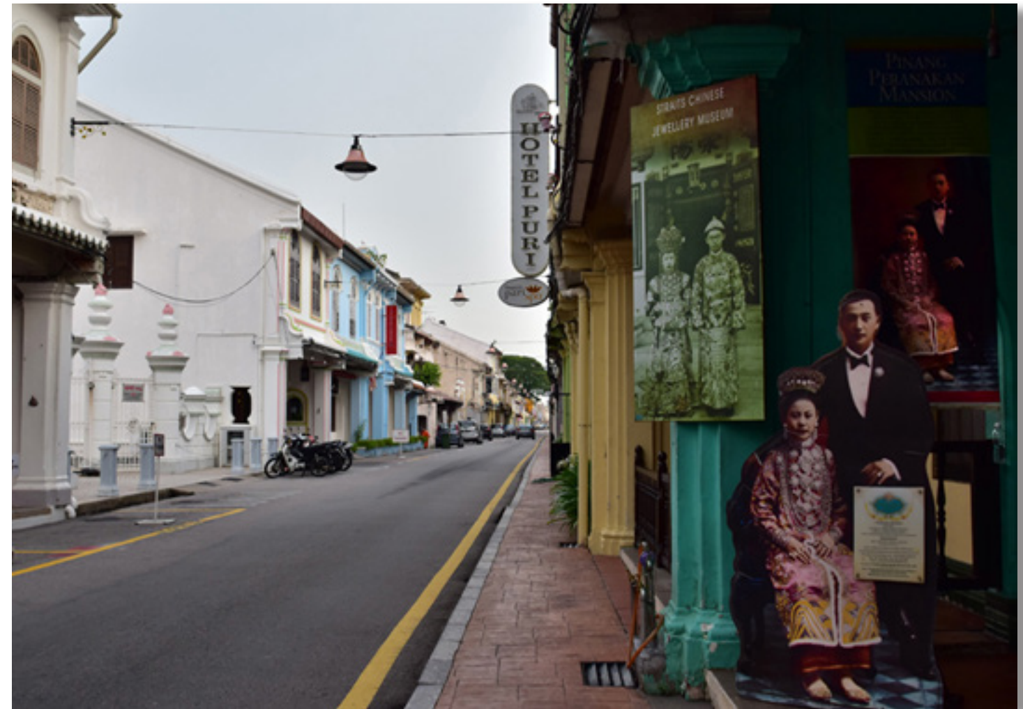
Hotel Puri, a heritage building, on Jalan Tun Tan Cheng Lock.