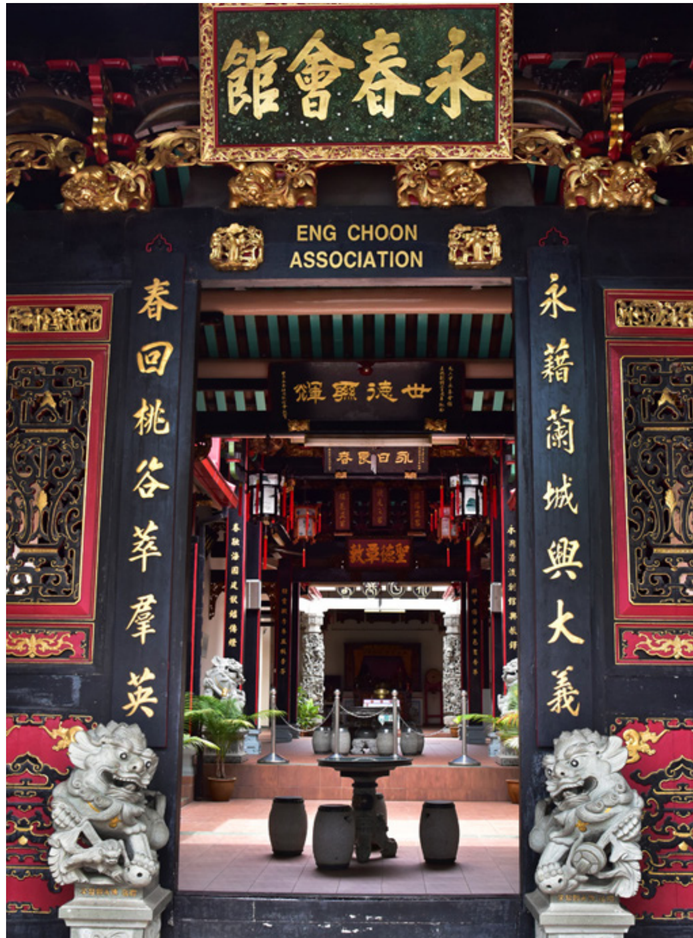
Eng Choon Association on Jalan Tun Tan Cheng Lock (Heeren Street) is a clan association for Chinese immigrants in Melaka who originated from the Eng Choon District of Fujian Province in China.